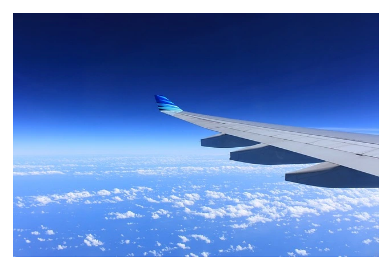
Day 1: Arrival

The journey of a long weekend Cairo starts at the first ever capital of ancient Egypt and the most important city in the world thousands of years ago, the ancient city of Memphis . The next stop is Saqqara , the burial ground for Egyptian kings and royals, will go to the Egyptian Museum and the Museum of Civilization , and after that you will You will learn about the Hanging Church and the Jewish Synagogue , you will go to you will go to Sharm El Sheikh , In the evening you can walk around the city and get to know its markets and streets. You can