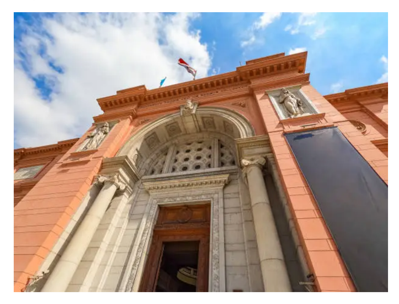
Day 4: Egyptian Museum, Old Cairo