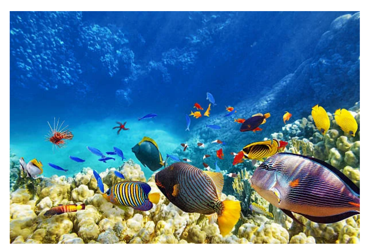
Day 2: Sharm El Sheikh

Once you arrive at Cairo Airport, our representative will receive and welcome you, and then you will travel to Sharm El-Sheikh . When you arrive at the airport, our representative will be waiting for you. He will take you in an air-conditioned car to go to your hotel to relax.