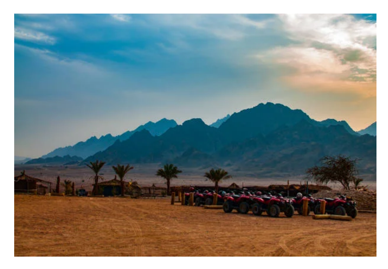
Day 3: Safari Tour

Once you arrive at Cairo Airport, our representative will receive and welcome you, and then you will travel to Sharm El-Sheikh . When you arrive at the airport, our representative will be waiting for you. He will take you in an air-conditioned car to go to your hotel to relax.