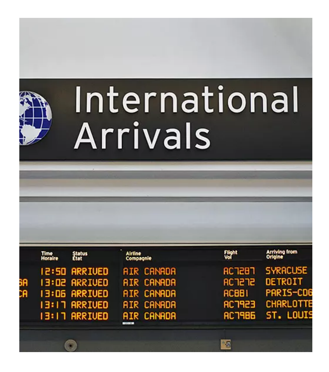
Day 4: Departure