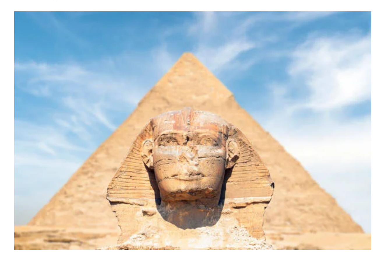
Day 2: Memphis , Sakkara , Pyramids Tour

Once you arrive at the airport, our representative will receive and welcome you. Then you will go with him to the Pyramids of Giza , Saqqara , and Memphis . The next day, you will go to the Egyptian Museum , and then you will go to Salah El- Din Citadel and Khan El Khalili Bazar .