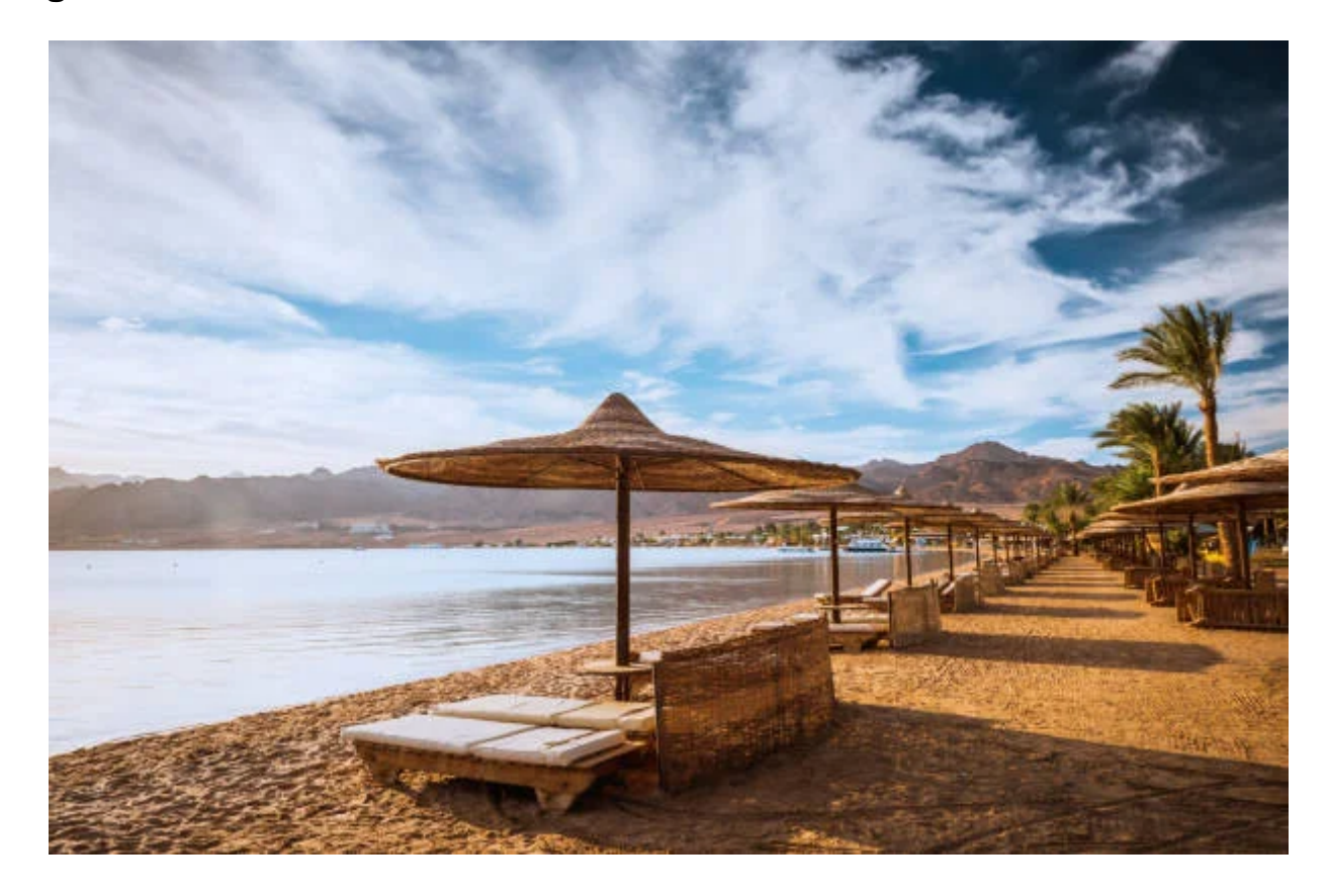
Day 3: Free Day, Hurghada

Once you arrive at Cairo Airport, our representative will receive and welcome you, and then you will travel to Hurghada When you arrive at the airport, our representative will be waiting for you. He will take you in an air-conditioned car to go to your hotel to relax.