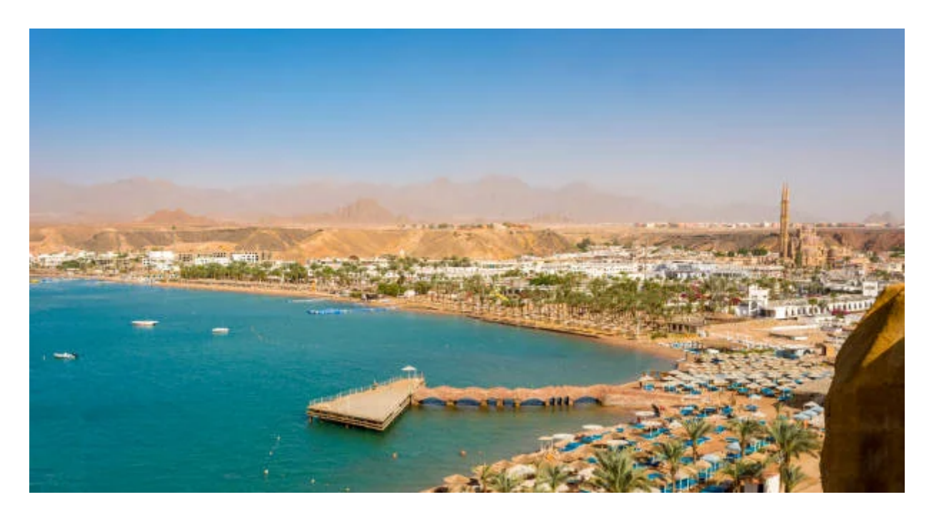
Day 2: Fly to Sharm El- Sheikh