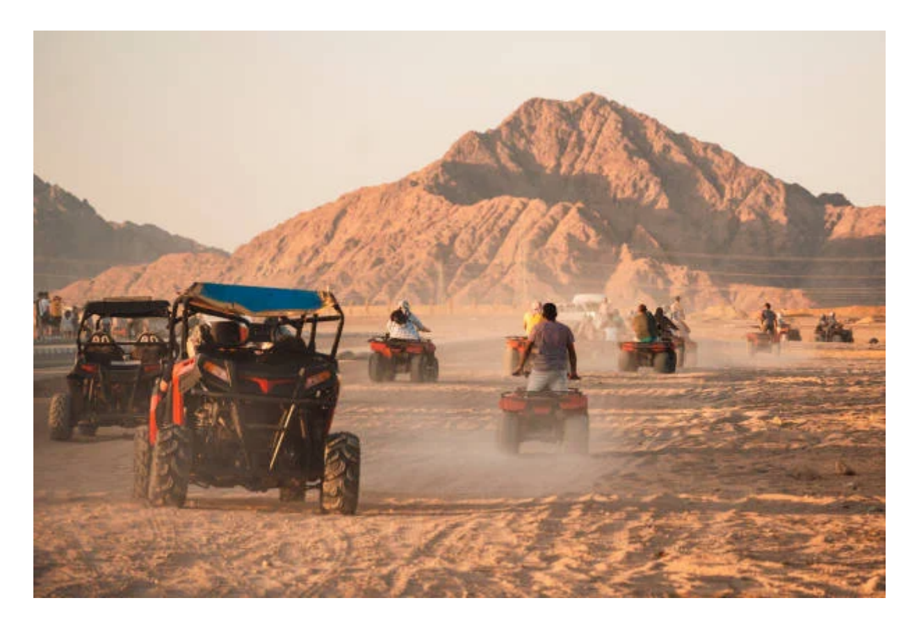
Day 4: Safari Tour