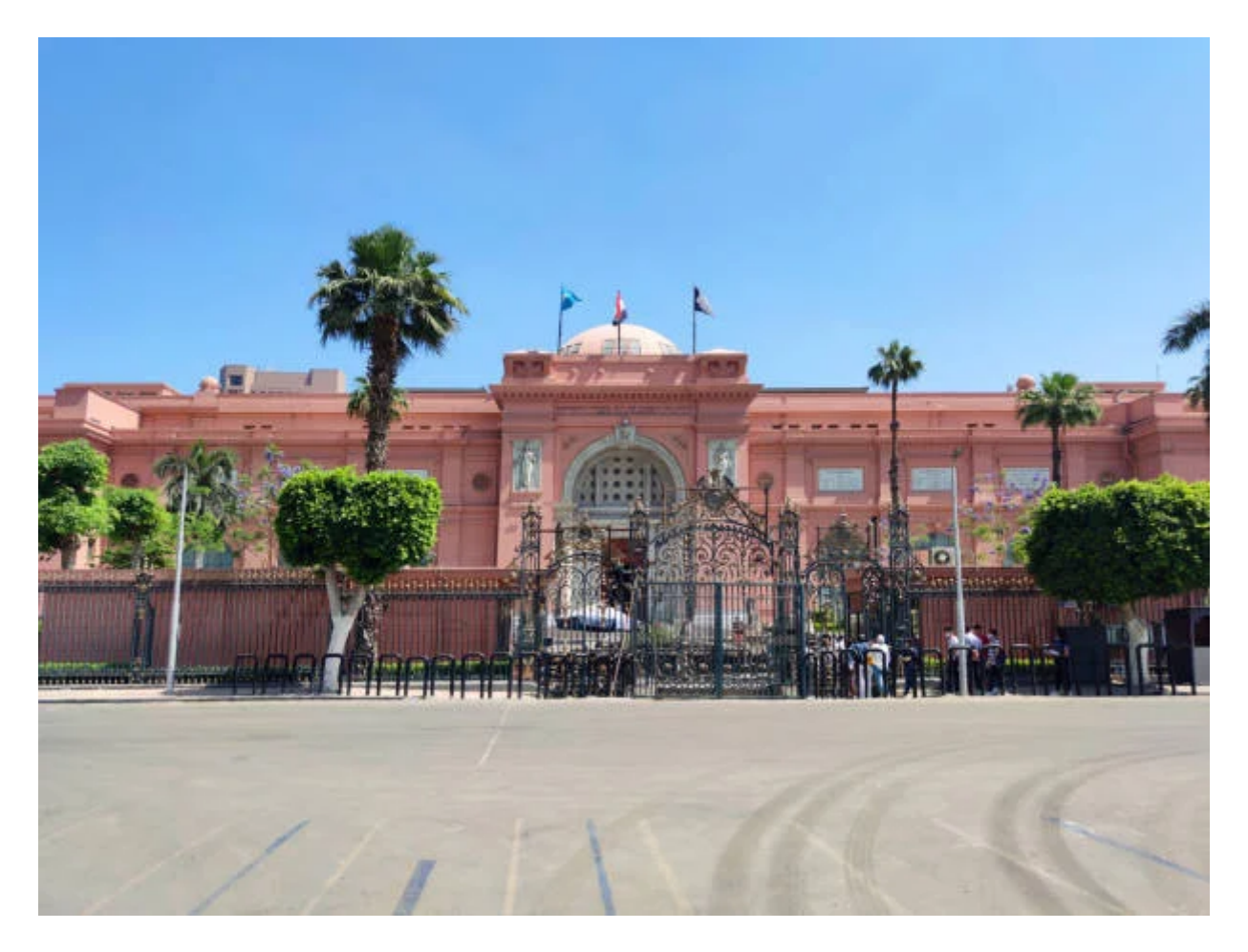
Day 3: Egyptian Museum, Old Cairo