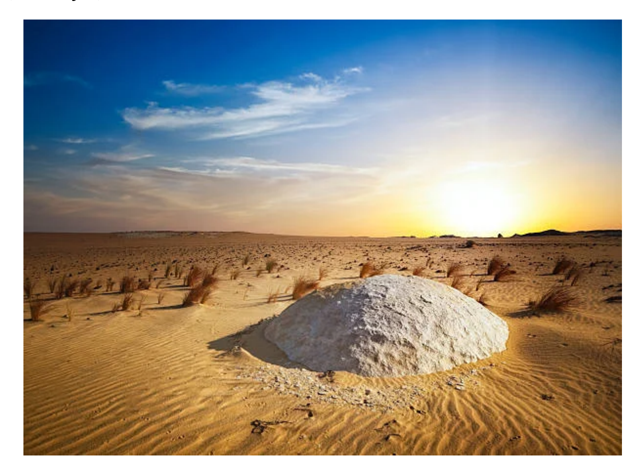
Day 6: White Desert, Baharyia, Cairo