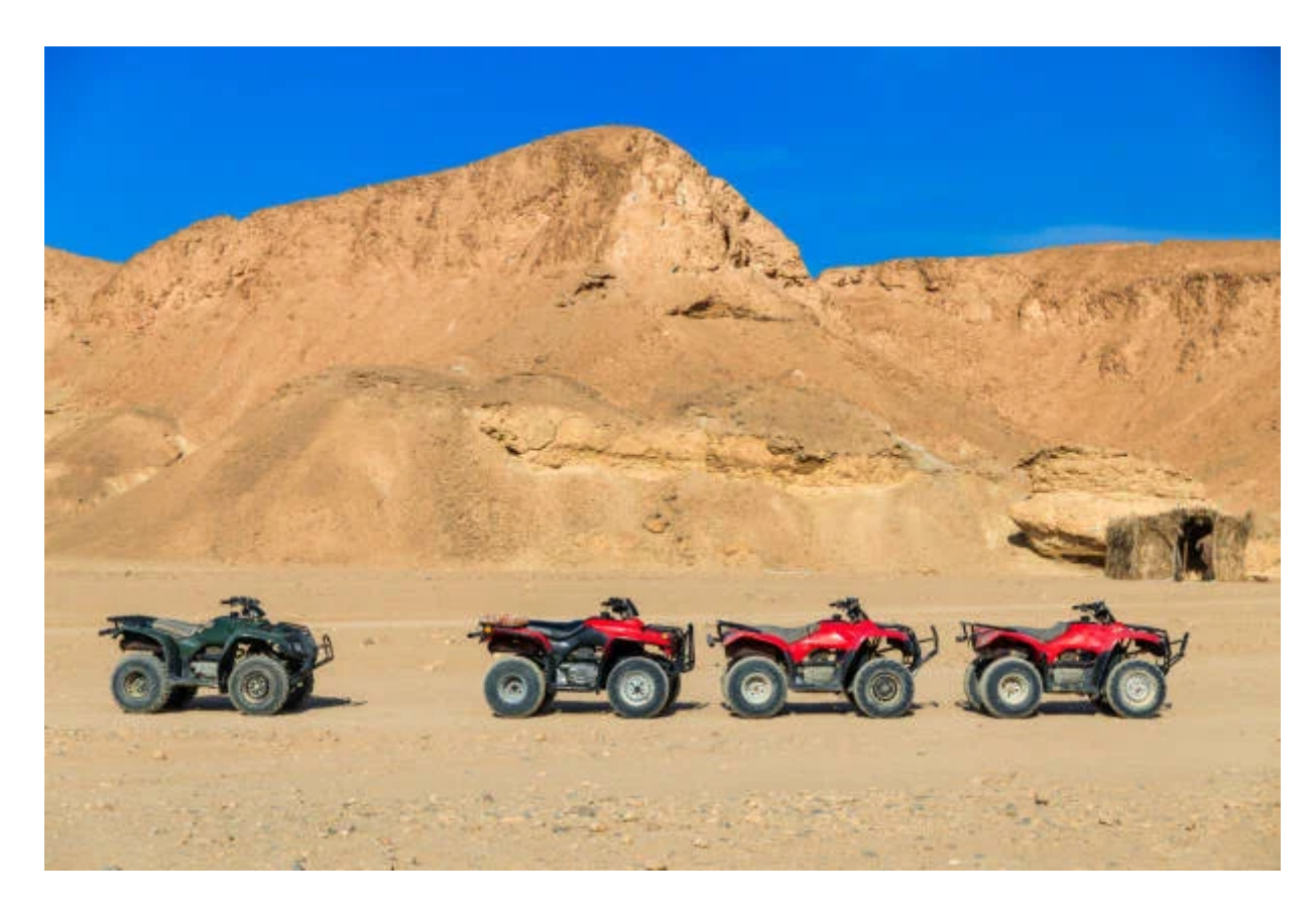
Day 3: Safari Tour

You will go to Mars Alam after our representative meets and greets you at the Cairo Airport. When you arrive at the airport, our agent will be there to welcome you. He will transport you to your accommodation so you can relax in a chic car.