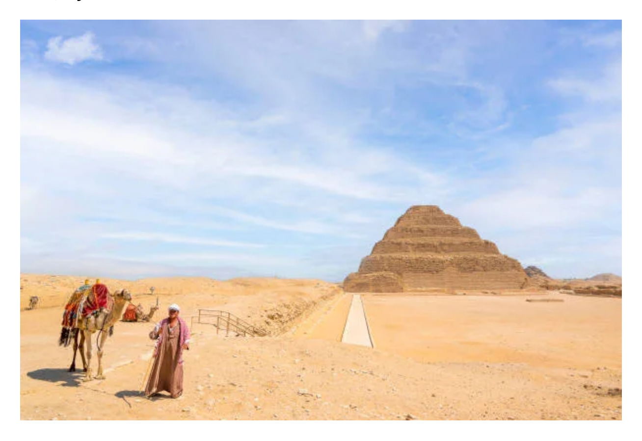
Day 2: Memphis, Sakkara, Pyramids Tour