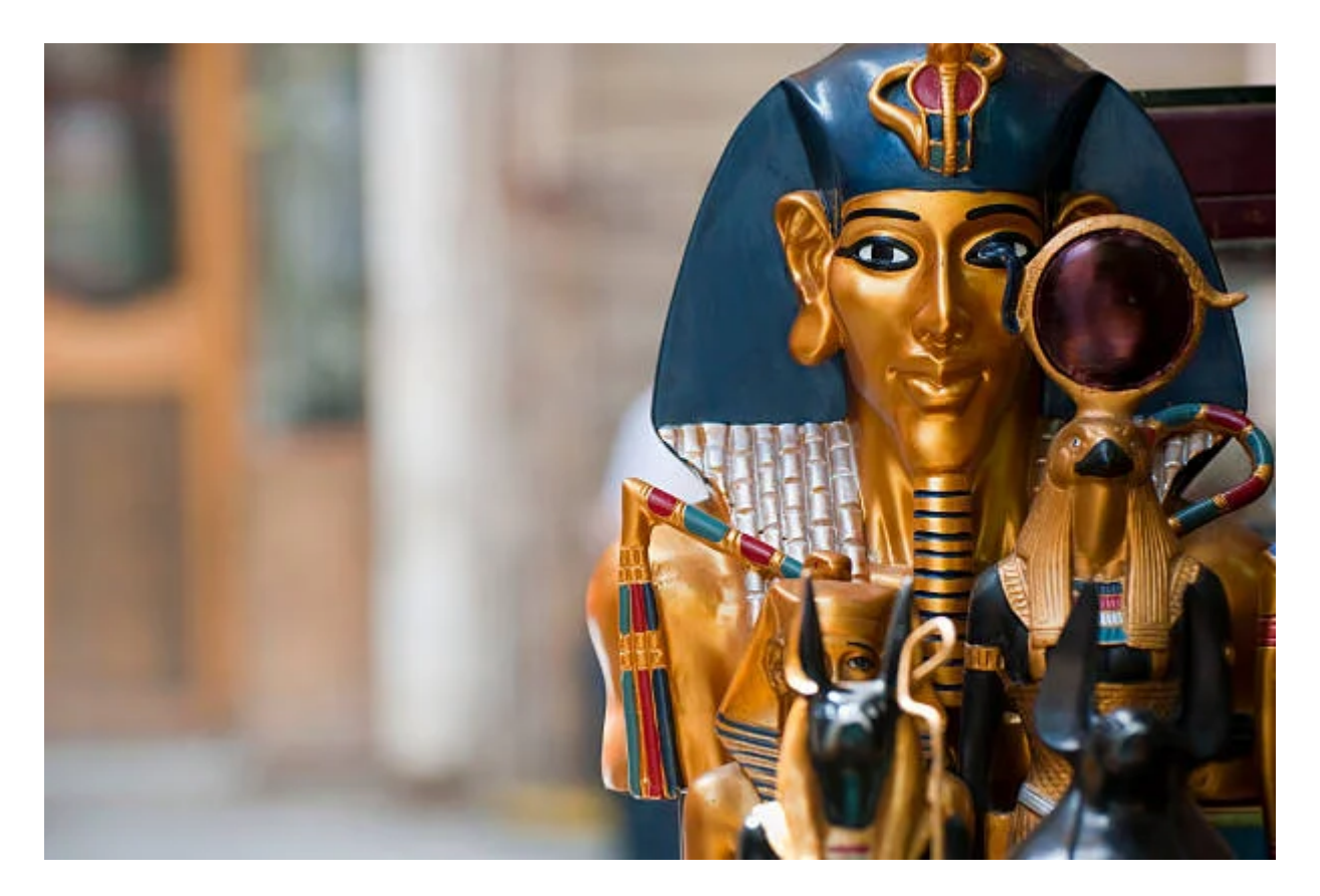
Day 5: Khan el-Khalili & Salah El-Din Citadel