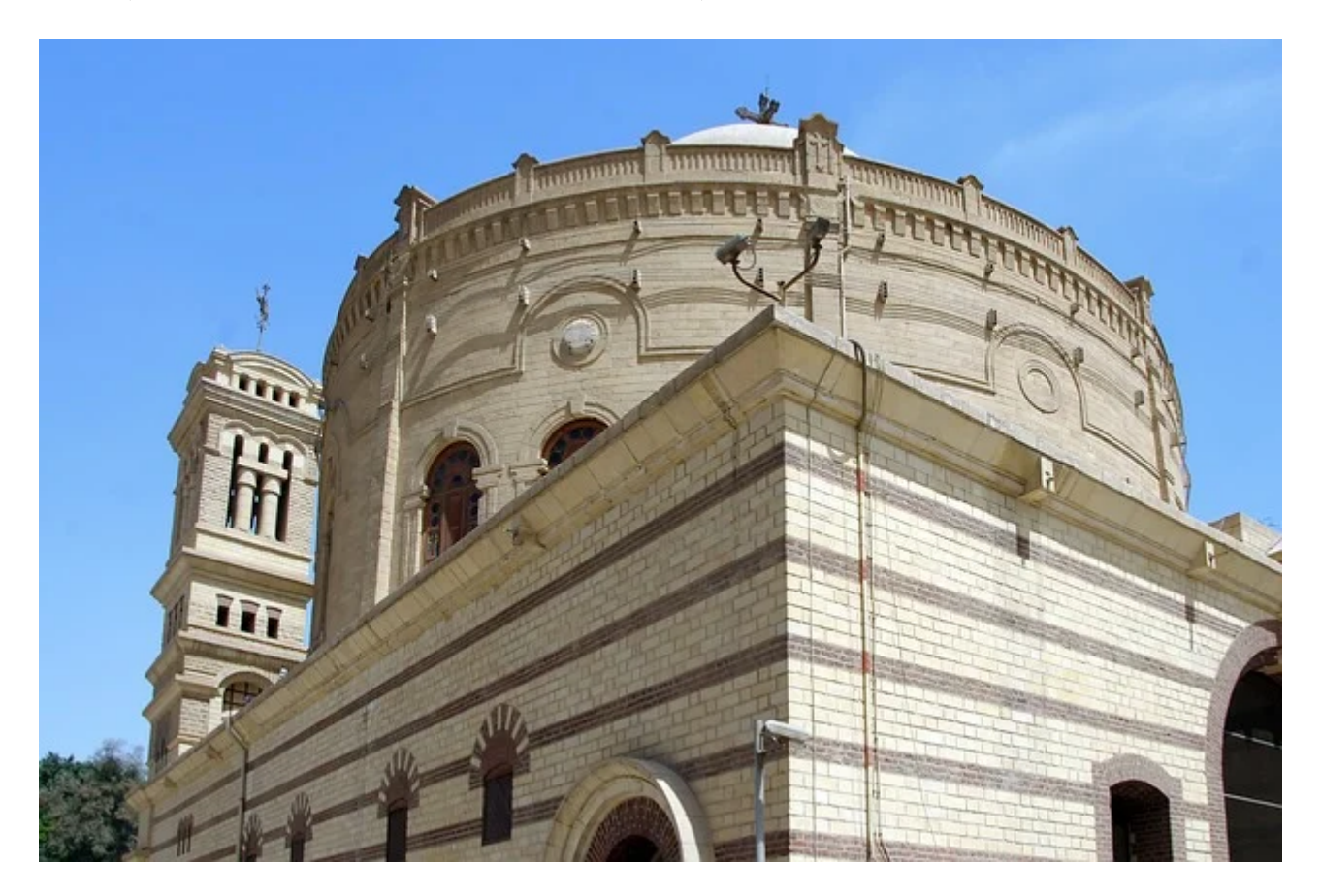
Day 3: Egyptian Museum, National Museum Of Civilization, Old Cairo

will go to the Egyptian Museum and the Museum of Civilization , and after that you will You will learn about the Hanging Church and the Jewish Synagogue ,