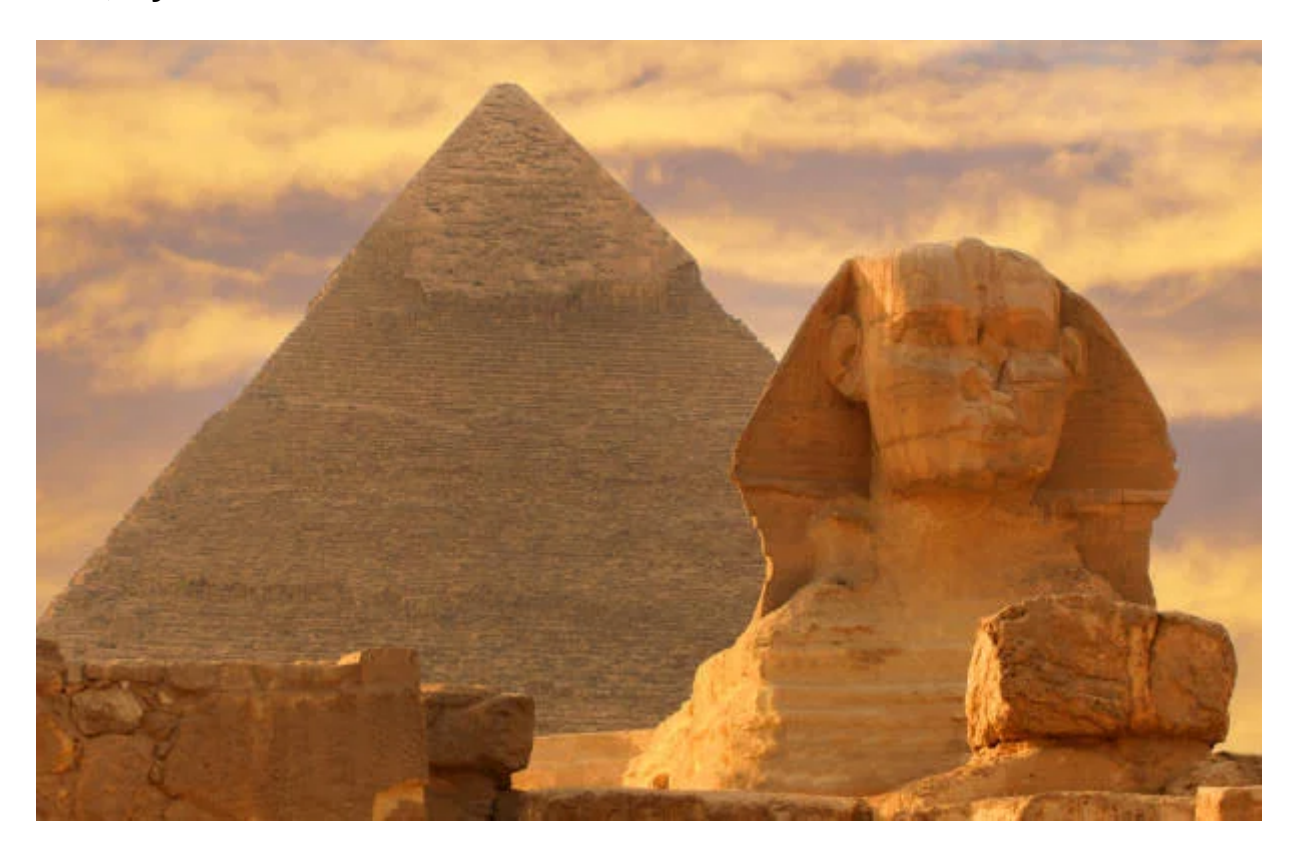
Day 2: Memphis, Sakkara, Pyramids Tour

will go to the Egyptian Museum and the Museum of Civilization , and after that you will You will learn about the Hanging Church and the Jewish Synagogue ,