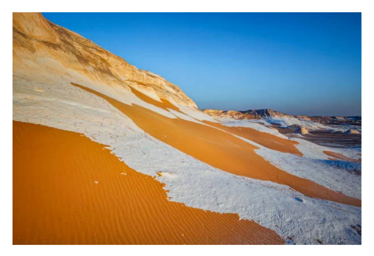
Day 4: Cairo – Baharia – White Desert

The next day, you will go to the area of the pyramids of Giza and see the pyramids, the three, and the Sphinx , and then visit the pyramids of Saqqara , some after, and then we will take you to our representative for lunch, then return to your hotel to relax. The morning of the next day, after eating breakfast, we will take you to our delegates to visit the Egyptian Museum and Religions, the Hanging Church , and the Jewish Museum , Coptic, and then take a break to eat lunch on the fourth day of your trip. After breakfast, you will go on a four-hour trip into the white desert on After about 350 km, you will stop to have lunch and some refreshments, also known as the jewel of the desert, because