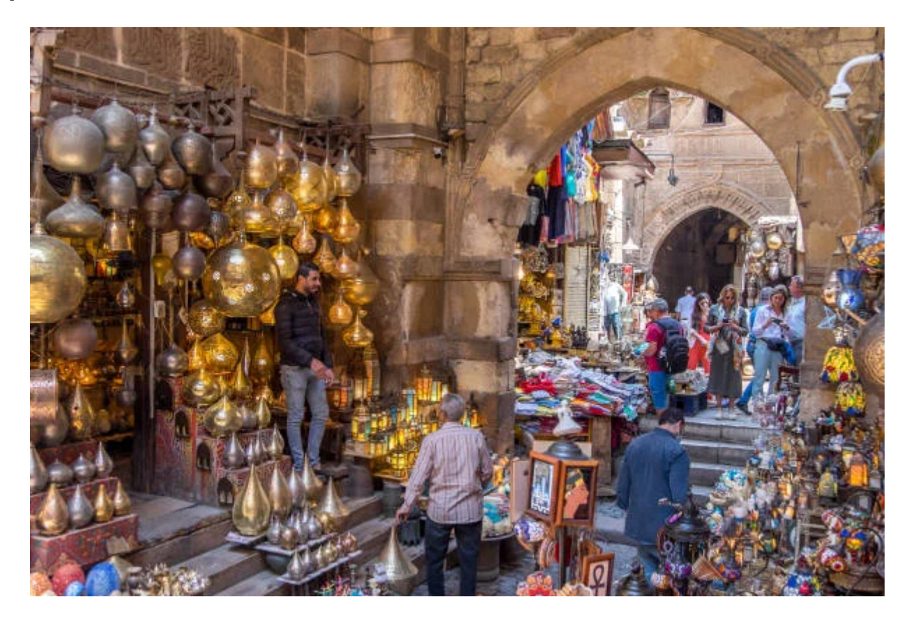
Day 6: National Egyptian Civilization, Khan El Khalili

The next day, you will go to the area of the pyramids of Giza and see the pyramids, the three, and the Sphinx , and then visit the pyramids of Saqqara , some after, and then we will take you to our representative for lunch, then return to your hotel to relax. The morning of the next day, after eating breakfast, we will take you to our delegates to visit the Egyptian Museum and Religions, the Hanging Church , and the Jewish Museum , Coptic, and then take a break to eat lunch on the fourth day of your trip. After breakfast, you will go on a four-hour trip into the white desert on After about 350 km, you will stop to have lunch and some refreshments, also known as the jewel of the desert, because