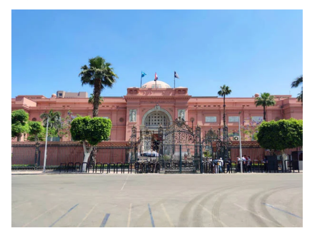
Day 3: Egyptian Museum, Old Cairo

The next day, you will go to the area of the pyramids of Giza and see the pyramids, the three, and the Sphinx , and then visit the pyramids of Saqqara , some after, and then we will take you to our representative for lunch, then return to your hotel to relax. The morning of the next