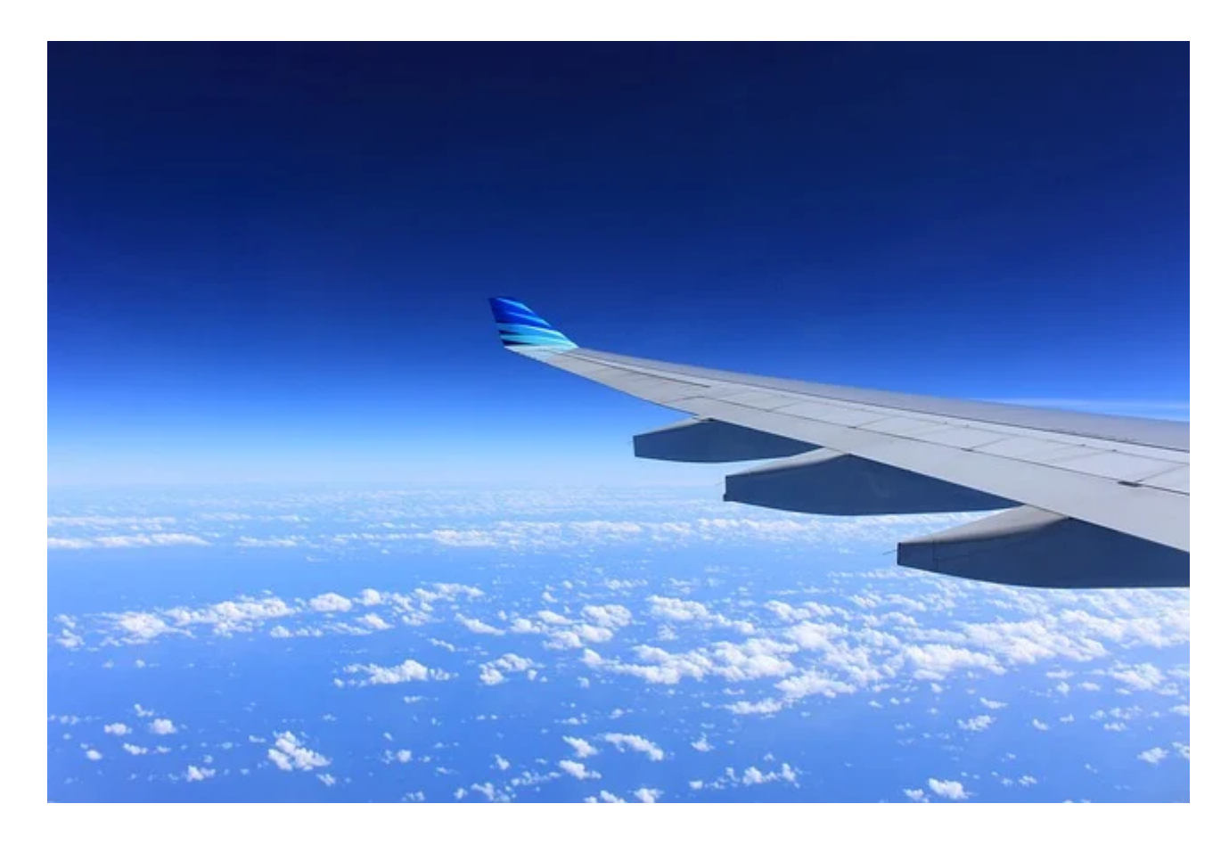
Day 7: Departure

The next day, you will go to the area of the pyramids of Giza and see the pyramids, the three, and the Sphinx , and then visit the pyramids of Saqqara , some after, and then we will take you to our representative for lunch, then return to your hotel to relax. The morning of the next day, after eating breakfast, we will take you to our delegates to visit the Egyptian Museum and Religions, the Hanging Church , and the Jewish Museum , Coptic, and then take a break to eat lunch on the fourth day of your trip. After breakfast, you will go on a four-hour trip into