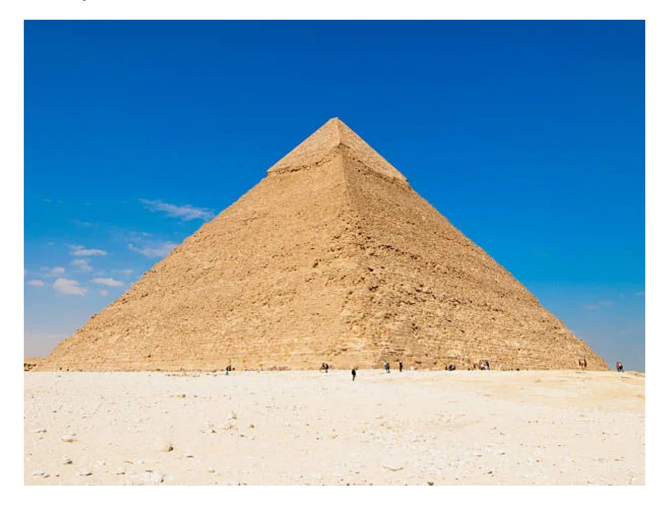
Day 2: Memphis, Sakkara, Pyramids Tour

When you arrive at Cairo airport, you will meet our representative, Sera, who is air-conditioned, and go to your hotel and spend the night fun and quiet. The next day, you will go to the area of the pyramids of Giza and see the pyramids, the three, and the Sphinx , and then visit the pyramids of Saqqara , some after, and then we will take you to our representative for lunch, then return to your hotel to relax. The morning of the next day, after eating breakfast, we will take you to our delegates to visit the Egyptian Museum and Religions, the Hanging Church , and the Jewish Museum , Coptic, and then take a break to eat lunch on the fourth day of your trip. After breakfast, you will go on a four-hour