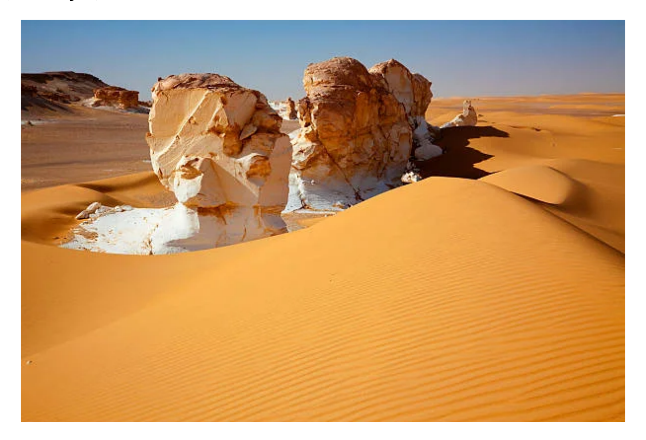
Day 6: White Desert, Baharyia, Cairo

When you arrive at Cairo airport, you will meet our representative, Sera, who is air-conditioned, and go to your hotel and spend the night fun and quiet. The next day, you will go to the area of the pyramids of Giza and see the pyramids, the three, and the Sphinx , and then visit the pyramids of Saqqara , some after, and then we will take you to our representative for lunch, then return to your hotel to relax. The morning of the next day, after eating breakfast, we will take you to our delegates to visit the Egyptian Museum and Religions, the Hanging Church , and the Jewish Museum , Coptic, and then take a break to eat lunch on the fourth day of your trip. After breakfast, you will go on a four-hour trip into the white desert on After about 350 km, you will stop to have lunch and some refreshments, also known as the jewel of the desert, because it is a hill of crystal-like crystals where you can watch suitable exhilarating when the light hits it, then it will be used in horses in the desert and dinner in the camp, but enjoy watching the stars, and the next day you can enjoy a full day in health. White will use the location