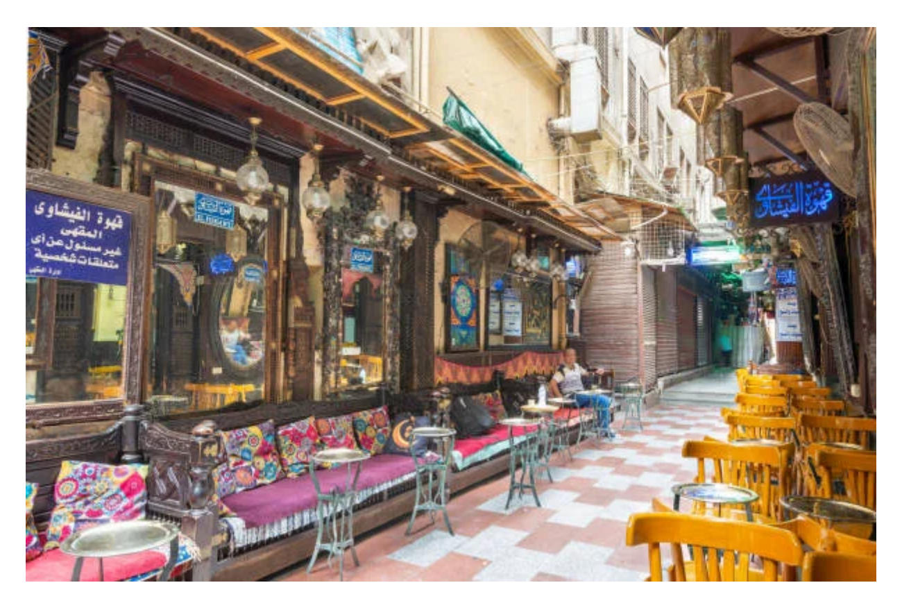
Day 5: Khan el-Khalili & Salah El-Din Citadel

When you get to the airport, we will transport you to our representative in an air-conditioned car so you can rest after a long day of travel to your Cairo hotel. The next morning, you may wake up after a peaceful night at our hotel. You will see Memphis , Saqqara , and the Giza pyramids with an expert tour after breakfast. Once this trip is over, we'll transport you to a nearby restaurant for lunch before dropping you off at your hotel , The next day, we will drive you to Alexandria to see the Qaitbay Citadel , where the Mamluk ruler had taken refuge in the late Mamluk era. In relation to the Pompey's Pillar , which is one of the Alexandrian Cemeteries ; in the evening, head back to the Cairo hotel to get ready for your visit to the Egyptian Museum , which has an extensive collection of antiquated artifacts; after that, head to the National Museum of Civilization , which leads to the church and the Jewish Temple , where you can learn about the nursery. After seeing the Coptic Museum , Coptic Plus goes to the Salah al-Din fortress and Khan Khalili Bazar , where leather, incense, and perfume are