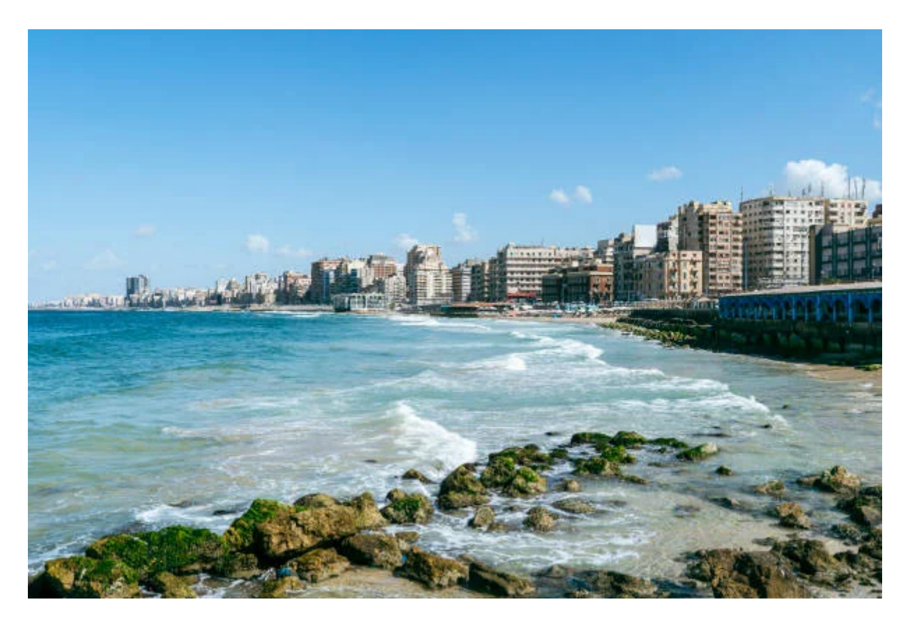
Day 4: Overday Alexandria

When you get to the airport, we will transport you to our representative in an air-conditioned car so you can rest after a long day of travel to your Cairo hotel. The next morning, you may wake up after a peaceful night at our hotel. You will see Memphis , Saqqara , and the Giza pyramids with an expert tour after breakfast. Once this trip is over, we'll transport you to a nearby restaurant for lunch before dropping you off at your hotel , The next day, we will drive you to Alexandria to see the Qaitbay Citadel , where the Mamluk ruler had taken refuge in the late Mamluk era. In relation to the Pompey's Pillar , which is one of the Alexandrian Cemeteries ; in the evening, head back to the Cairo hotel to get ready for your visit to the Egyptian Museum , which has an extensive collection of antiquated artifacts; after that, head to the National Museum of Civilization , which leads to the church and the Jewish Temple , where you can learn about the nursery. After seeing the Coptic Museum , Coptic Plus goes to the Salah al-Din fortress and Khan Khalili Bazar , where leather, incense, and perfume are