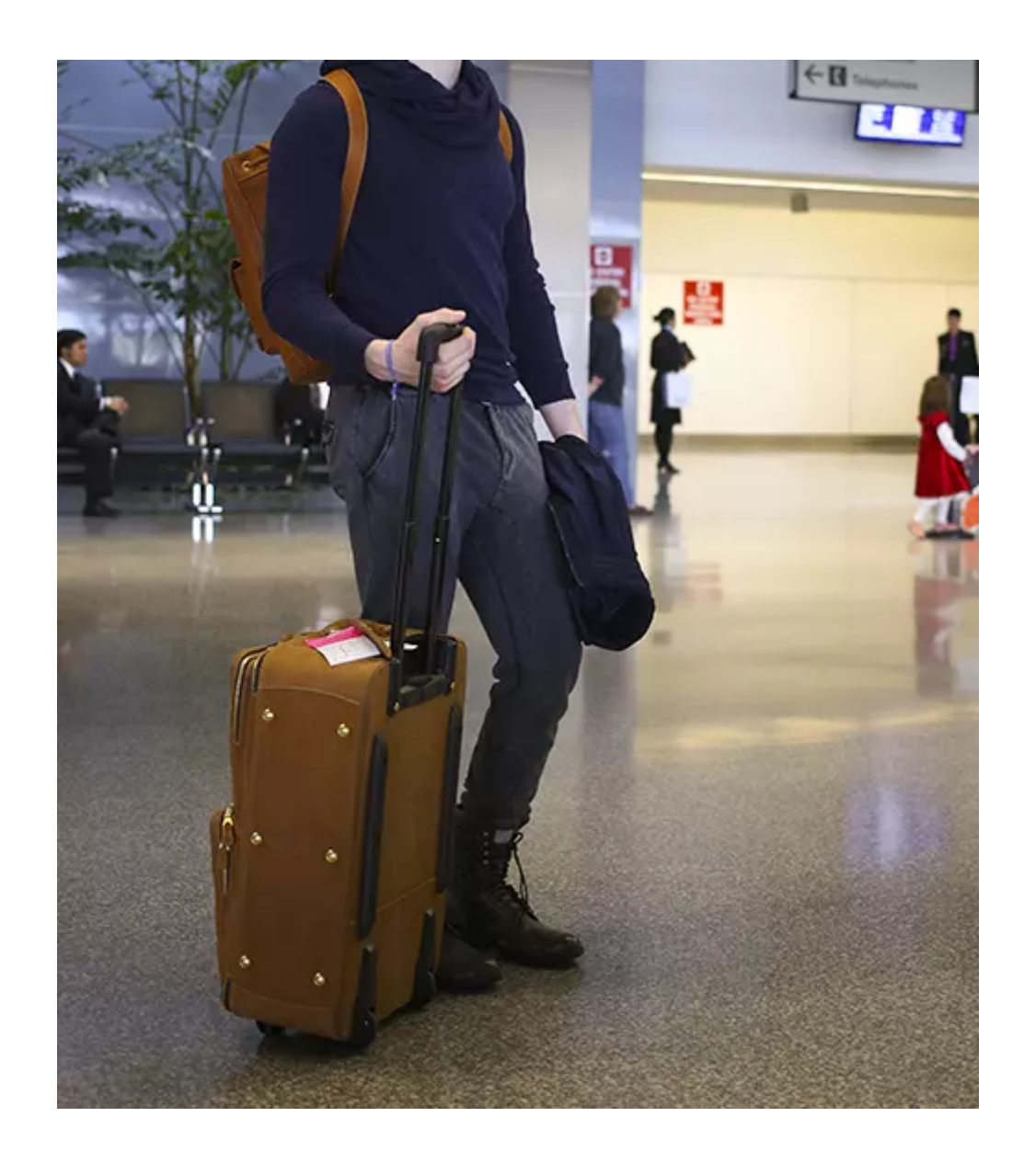
Day 6: Departure