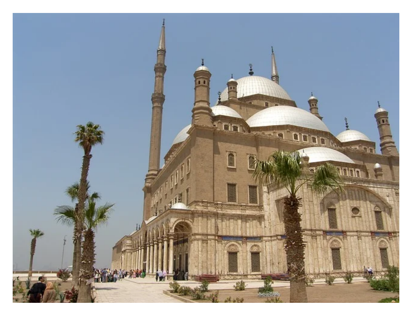
Day 5: Khan el-Khalili & Salah El-Din Citadel

the next day you will go to the Pyramids of Giza and then Saqqara and then Memphis and have lunch at a local restaurant the next day have breakfast at the hotel, our representative will take you to the National Museum of Civilization Which provides a historical overview