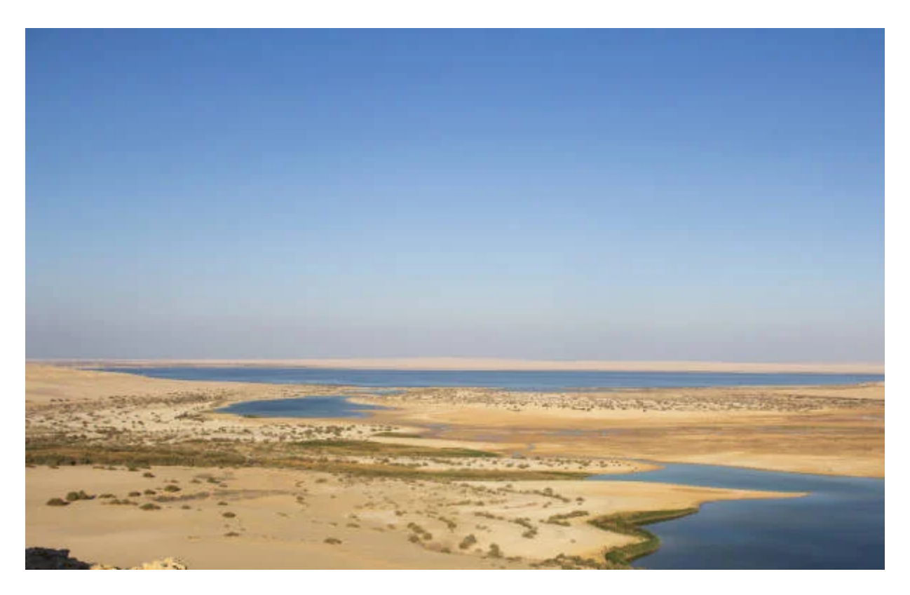
Day 4: Overday Fayoum

the next day you will go to the Pyramids of Giza and then Saqqara and then Memphis and have lunch at a local restaurant the next day have breakfast at the hotel, our representative will take you to the National Museum of Civilization Which provides a historical overview from the Stone Age until now. and then to the Egyptian Museum It contains a large collection of ancient Egyptian antiquities. and then you will get acquainted with the Coptic civilization, where the Jewish Temple , The Hanging Church and Mary of Gergs ,