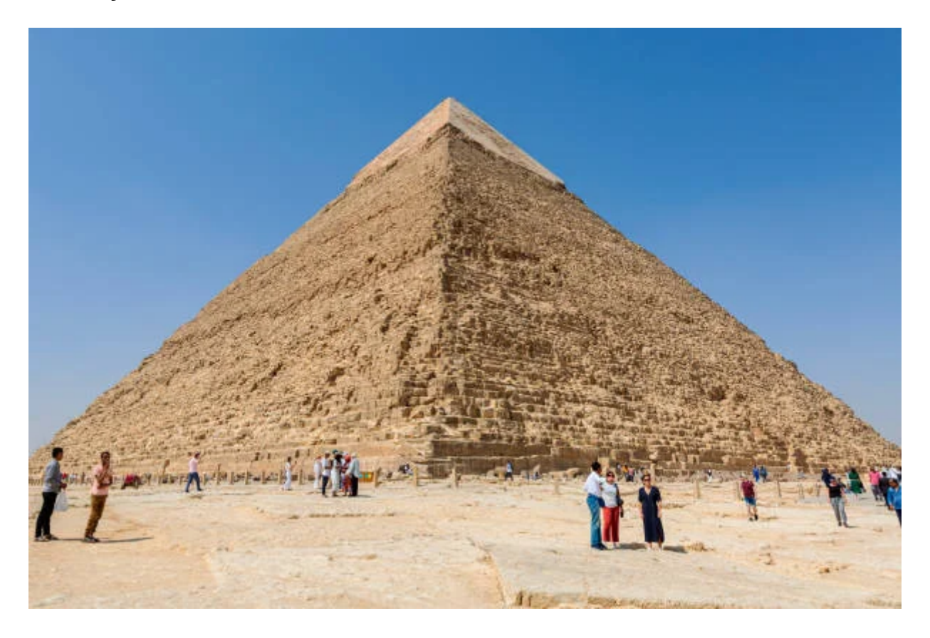
Day 2: Memphis, Sakkara, Pyramids Tour