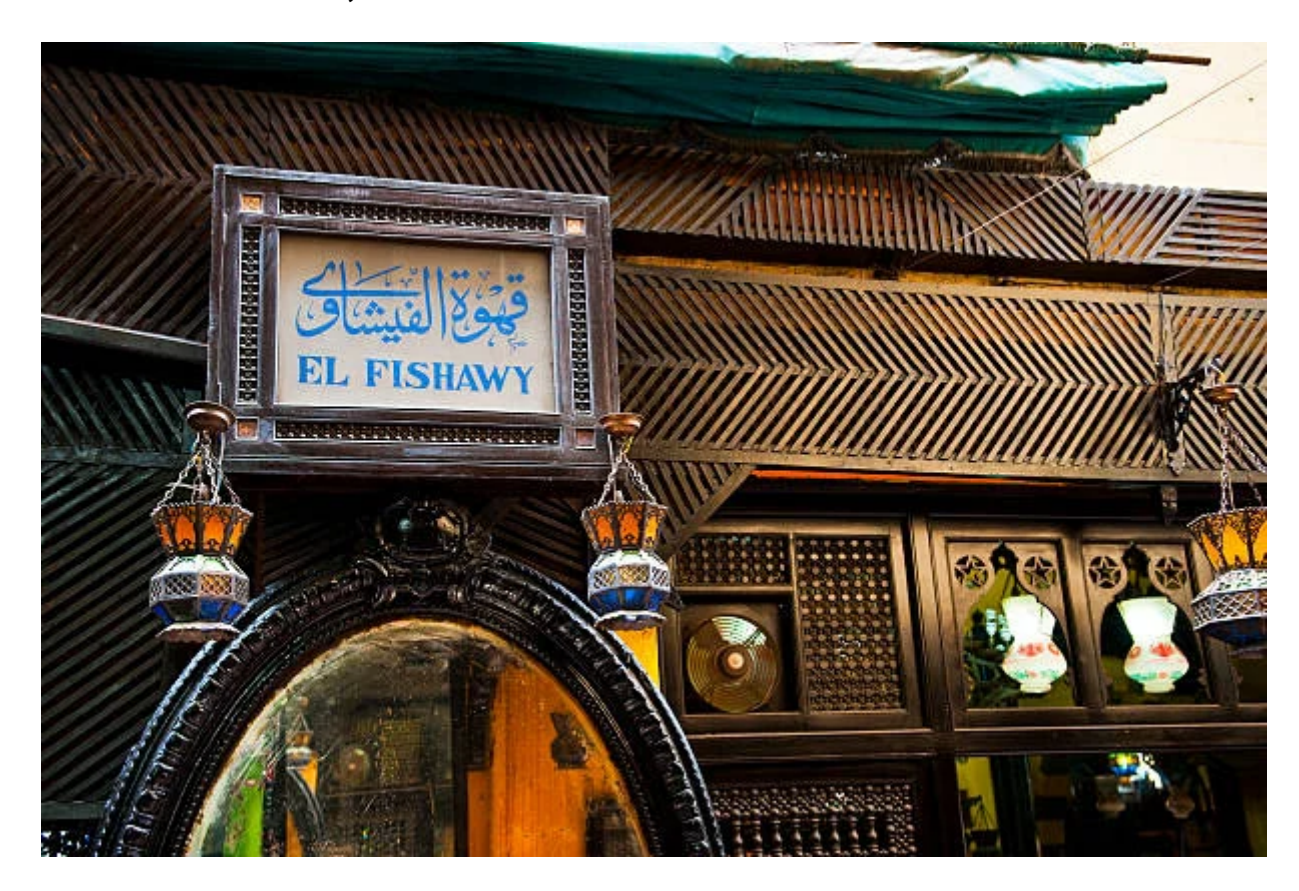
Day 7: National Museum of Civilization, Khan El Khalili bazar

When you arrive at Cairo airport, you will meet our representative, Sera, who is air-conditioned, and go to your hotel and spend the night fun and quiet. The next day, you will go to the area of the pyramids of Giza and see the pyramids, the three, and the Sphinx , and then visit the pyramids of Saqqara , some after, and then we will take you to our representative for lunch, then return to your hotel to relax. The morning of the next day, after eating breakfast, we will take you to our delegates to visit the Egyptian Museum and Religions, the Hanging Church , and the Jewish Museum , Coptic, and then take a break to eat lunch on the fourth day of your trip. After breakfast, you will go on a four-hour trip into the white desert on After about 350 km, you will stop to have lunch and some refreshments, also known as the jewel of the desert, because it is a hill of crystal-like crystals where you can watch suitable exhilarating when the light hits it, then it will be used in horses in the desert and dinner in the camp, but enjoy watching the stars, and the next day you can enjoy a full day in health. White will use the location