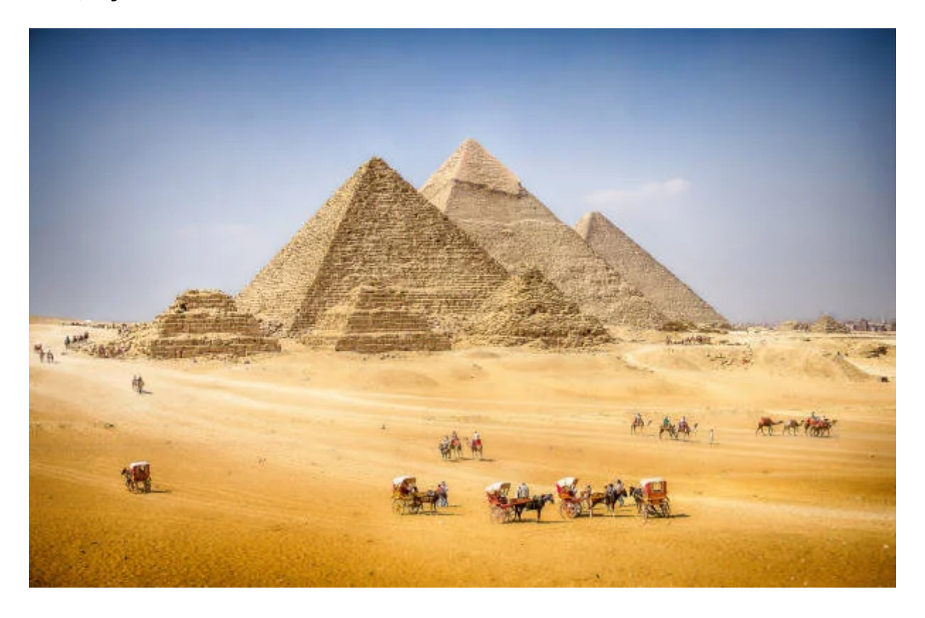
Day 2: Memphis, Sakkara, Pyramids Tour