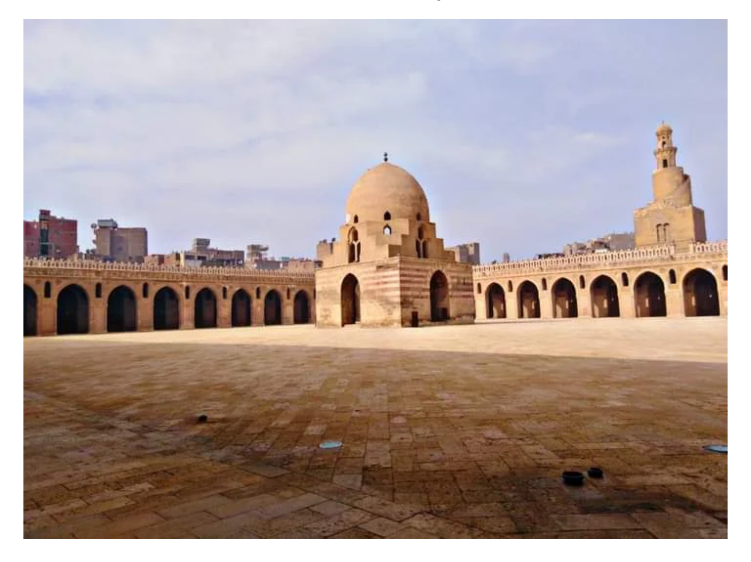
Day 4: Salah El-Din Citadel, Al-Sultan Hassan & Ibn Tulun Mosques