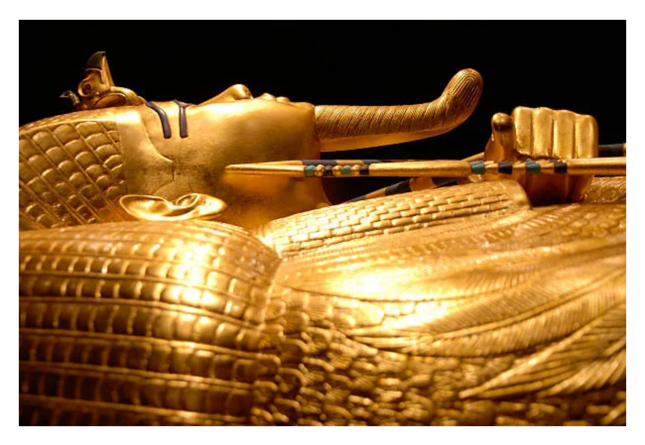
Day 3: Egyptian Museum, National Museum of Civilization, Old Cairo

Upon arrival at the airport, our representative will take you in a private air-conditioned car to your luxury hotel in Cairo, where you can enjoy a comfortable and quiet night at the hotel. The next day, our representative will take you to the Giza Pyramid complex, including the three pyramids, Sphinx , and several mausoleums, followed by a private visit to the Saqqara ruins site, home to several pyramids, including the pyramid of Djoser, the amphitheater, dated dating back to the Third Dynasty of Egypt, which is the oldest known finished stone building in history, and then lunch at a luxurious restaurant. The next day we will go to the Egyptian Museum , which has a large collection of ancient Egyptian antiquities. This place is one of the most beautiful antiquities in Egypt. the largest and most famous museum in the world, and visit the Museum of Civilization , which offers a comprehensive look at Egyptian civilization. At the end of the day, we will visit Salah El- din Citadel and then to the Ahmed Ibn Tulun Mosque and the Sultan Hassan Mosque then return to the luxury hotel to rest, and tomorrow