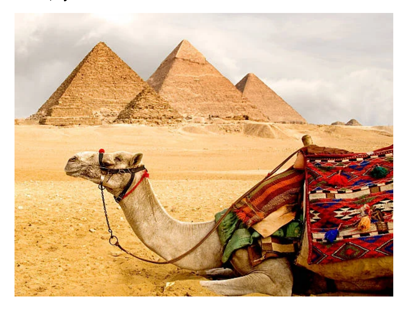
???? 2: Memphis , Sakkara , Pyramids Tour

When you arrive at the airport, our representative will receive you and welcome you. After that, you will go to the three pyramids of Giza , the Sphinx , the Step Pyramid of Saqqara , and Memphis . The next day, you will go to the Egyptian Museum and then the Museum of National Egyptian Civilization to learn about the civilization of ancient Egypt. With it, you will go to the Hanging Church to learn about the Coptic civilization, in addition to... The next day you will go to the Citadel of Salah al-Din al-Ayyubi , in addition to the Muhammad Ali Mosque and the Al-Khan Market in the evening. On the last day, after eating breakfast at your hotel, you will go to the airport with