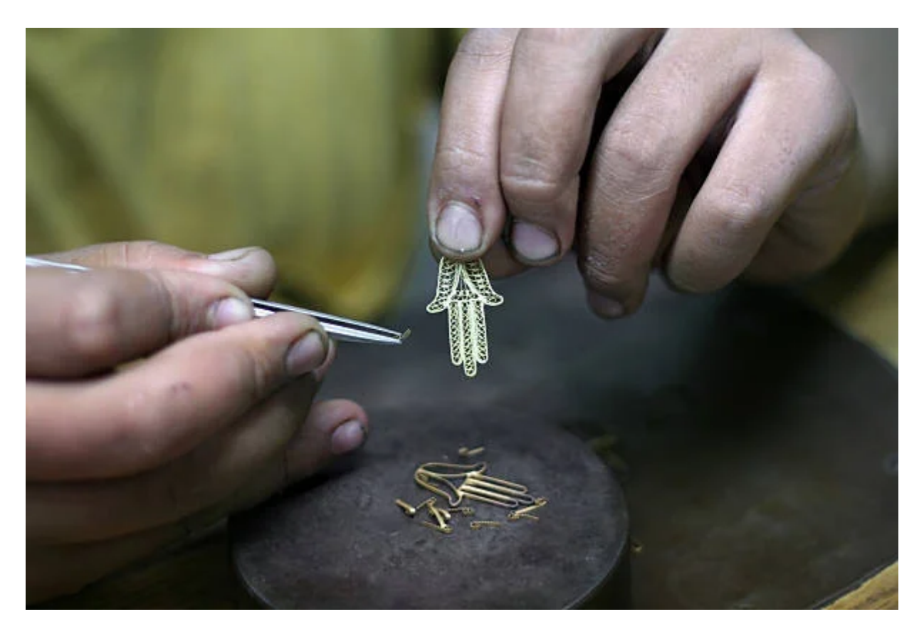
???? 3: Egyptian Museum ,Salah El Din Citadel , Khan El Khalili

Once you arrive at the airport, our representative will receive and welcome you. Then you will go with him to the Pyramids of Giza , Saqqara , and Memphis . The next day, you will go to the Egyptian Museum , and then you will go to Salah El- Din Citadel and Khan El Khalili Bazar .