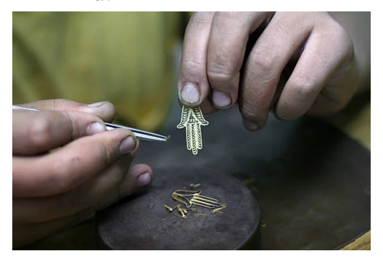
???? 7: Fly back to Cairo , National Egyptian Museum , Khan El Khalili