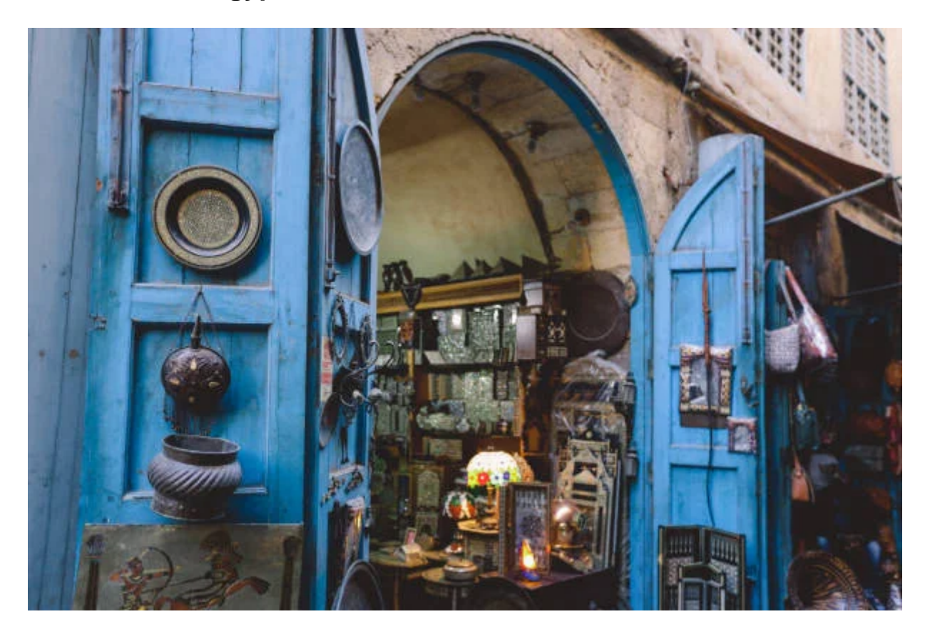
???? 6: Fly beck to Cairo , National Egyptian Civilization , Khan El- Khalili

Our representative will receive you from the airport carrying a banner bearing your name. After welcoming you at the airport, he will take you to a hotel in Cairo. The next day, you will go to Sharm El-Sheikh and enjoy the beaches of Sharm. You can do many activities. The next day, you will go on a safari tour with our representative, and after spending two days in Sharm. Sheikh, you will continue the rest of your trip in Cairo.