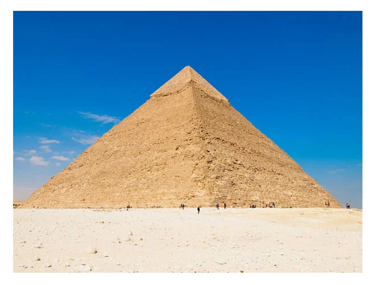
???? 7: Memphis , Sakkara , Pyramid Tour

you will go to you will go to Hurghada , In the evening you can walk around the city and get to know its markets and streets. You can also buy gifts for your friends. On the next day, you can practice many activities. You can also see rare fish. You can practice diving. And water skiing. The next day, you can spend time on a yacht all day,