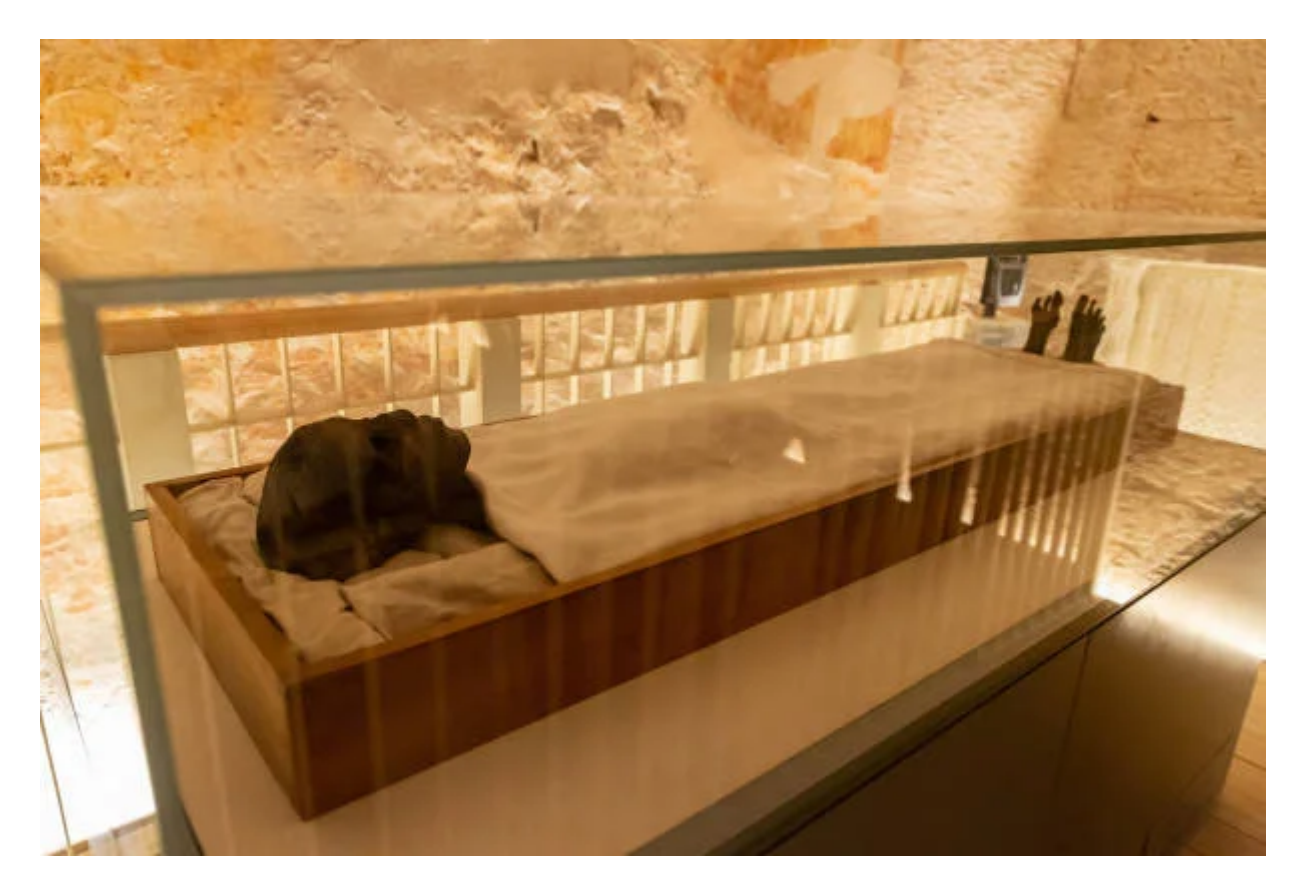
???? 3: Egyptian Museum , National Museum of Civilization , old Cairo

When you arrive at Cairo airport, our representative will take you to the hotel and the next day you will go to the Pyramids of Giza and then Saqqara and then Memphis and have lunch at a local restaurant the next day have breakfast at the hotel, our representative will take you to the National Museum of Civilization and then to the Egyptian Museum and then you will get acquainted with the Coptic civilization, where the Jewish Temple , The Hanging Church and Mary of Gergs and the next day you will go to Fayoum with our representative, who takes you on an interesting tour to the Village of Tunis to have breakfast,