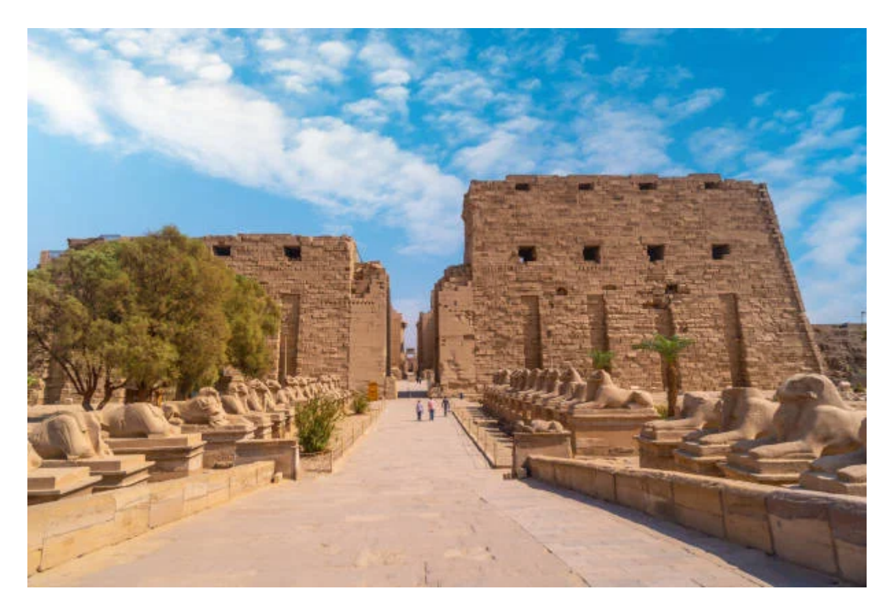
???? 1: Arrival, East Bank