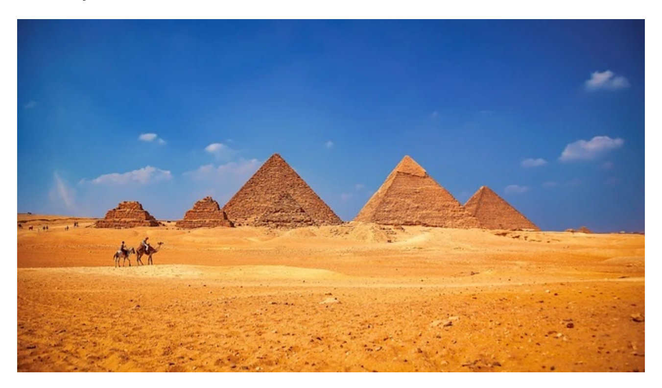
Dia 2: Memphis, Sakkara, Pyramids Tour