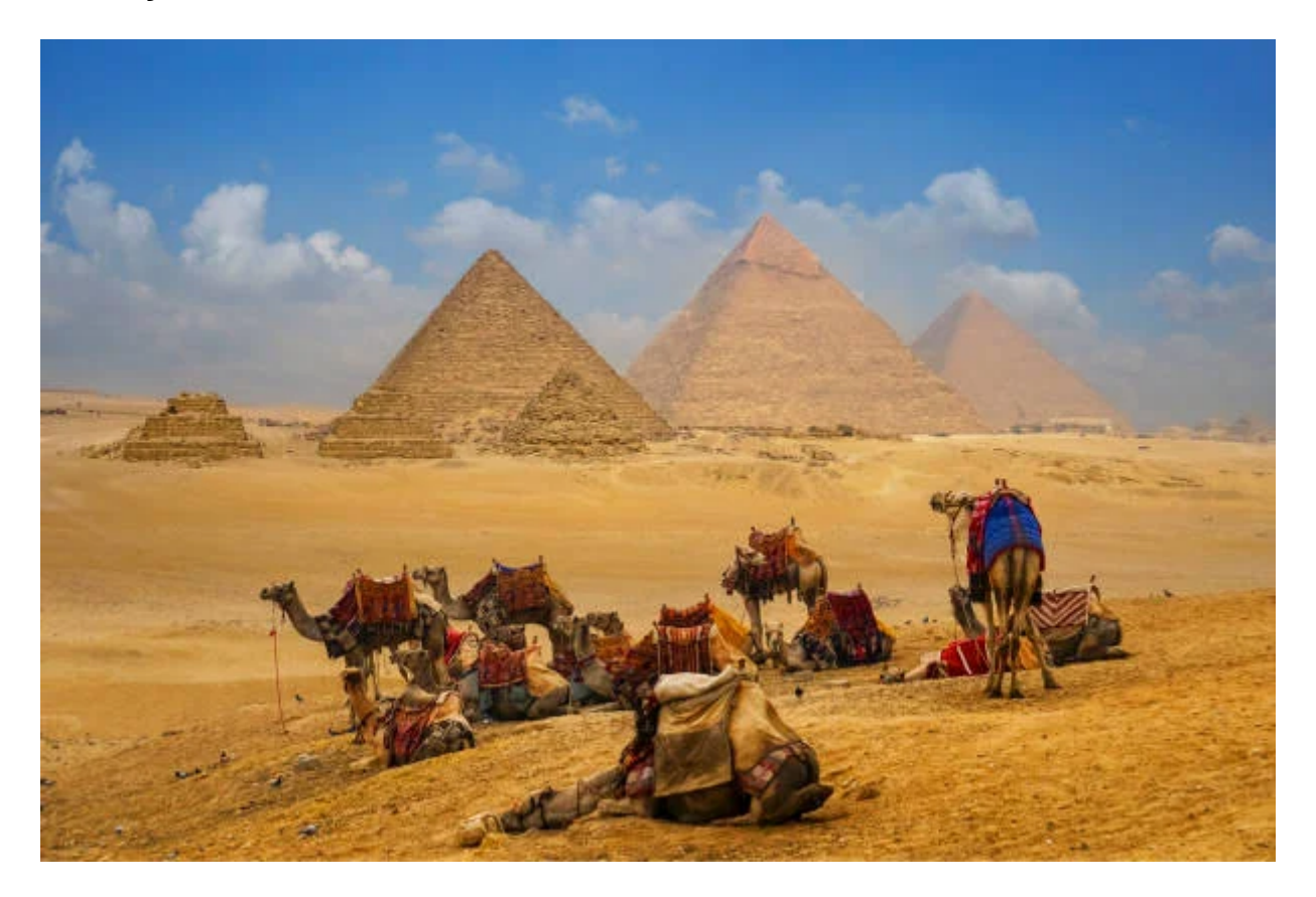
Dia 2: Memphis, Sakkara, Pyramids Tour