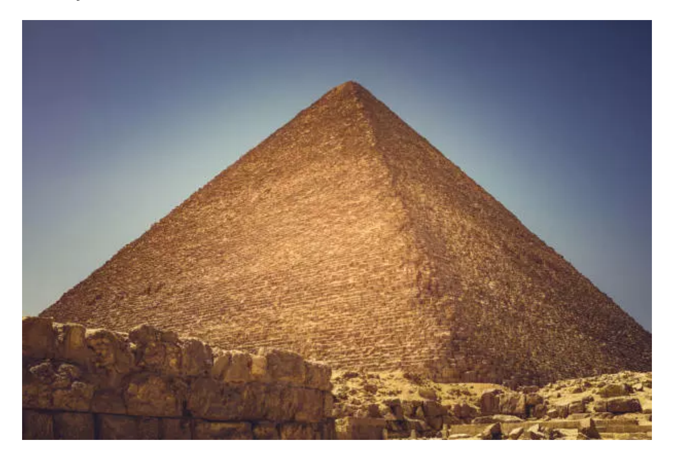
Dia 2: Memphis, Sakkara, Pyramids Tour