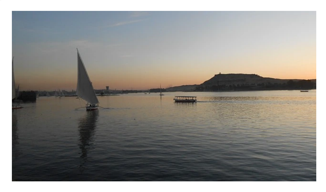
Dia 5: Flauca Tour