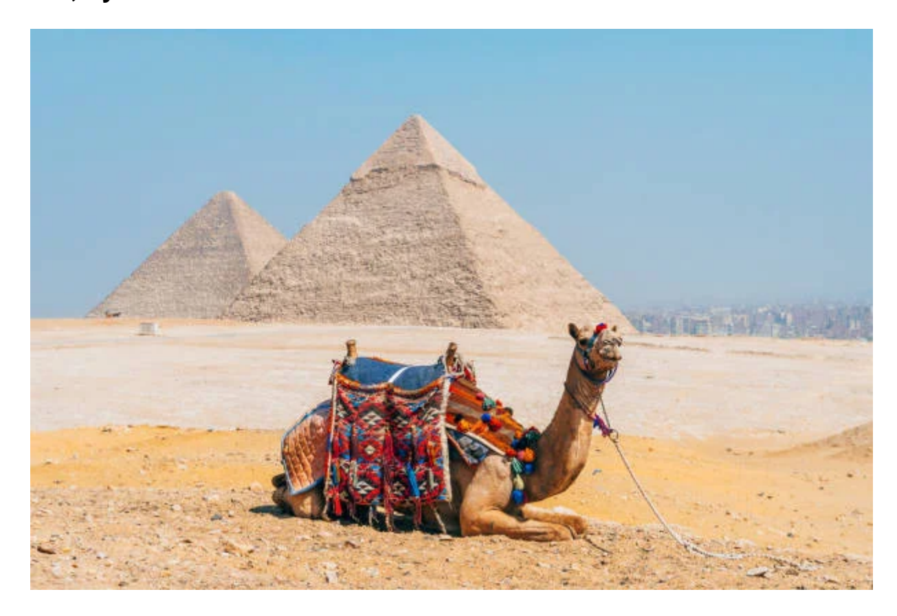
Dia 2: Memphis, Sakkara, Pyramids Tour