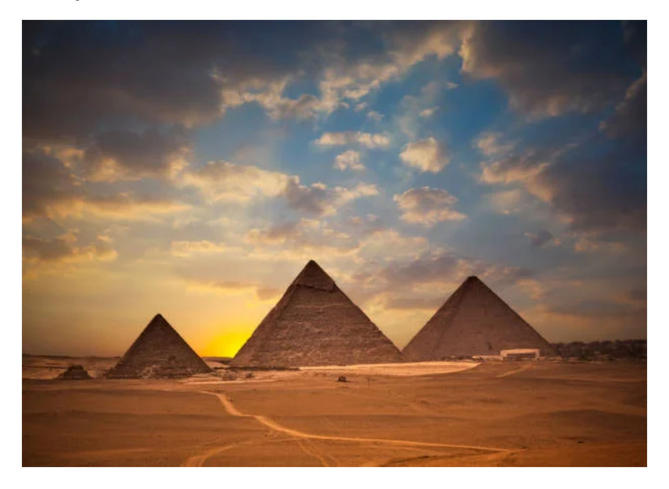
Dia 2: Memphis, Sakkara, Pyramids Tour

Egypt is one of the most interesting cities in the world, and there is no need to talk about how fantastic it could be to spend your <a href="https://example.com/honeymoon-package">honeymoon-package in Egypt</a> with your partner among the Pyramids and the Nile River onboard the Nile cruise. With our tours, you and your partner will see many landmarks in Egypt. Such as the <a href="https://example.com/honeymoon-package">Giza Pyramids</a>, Memphis , Saqqara , the <a href="https://example.com/honeymoon-package">Egyptian Museum</a>, and Khan El-Khalili Market, then be ready to have a real adventure through the Nile River from Luxor to Aswan.