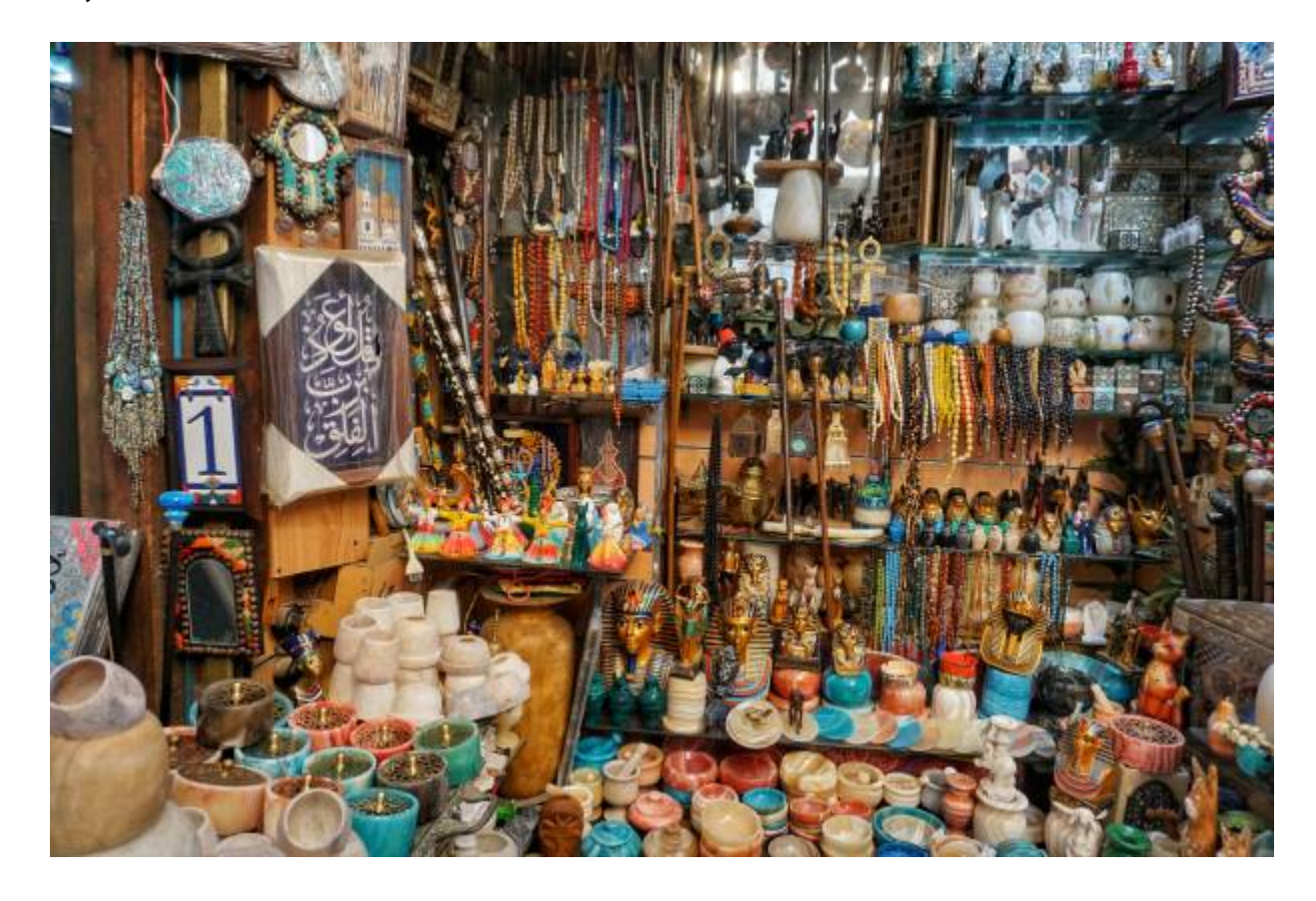
Dia 8: Fly back to Cairo, Khan El Khalili