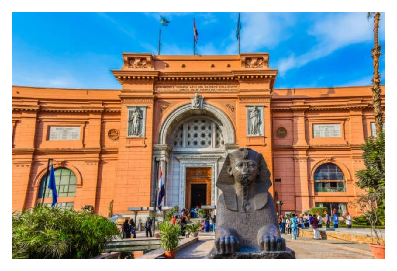
Dia 3: Egyptian Museum, National Museum of Civilization, Old Cairo