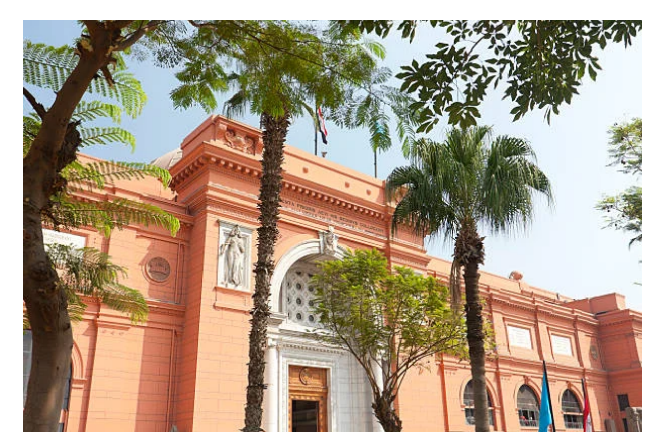
Dia 3: Egyptian Museum , National Museum of Civilization , old Cairo

When you arrive at the airport, our representative will receive you and welcome you. After that, you will go to the three pyramids of Giza , the Sphinx, the Step Pyramid of Saqqara , and Memphis . The next day, you will go to the Egyptian Museum and then the Museum of National Egyptian Civilization to learn about the civilization of ancient Egypt. With it, you will go to the Hanging Church to learn about the Coptic civilization, in addition to the Jewish Temple . On the last day, after having breakfast at your hotel, you will go to the airport with our representative.