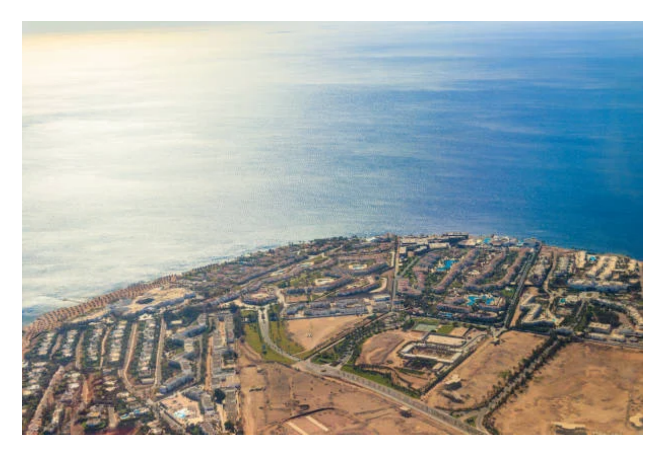
Dia 2: Fly to Sharm El-Sheik