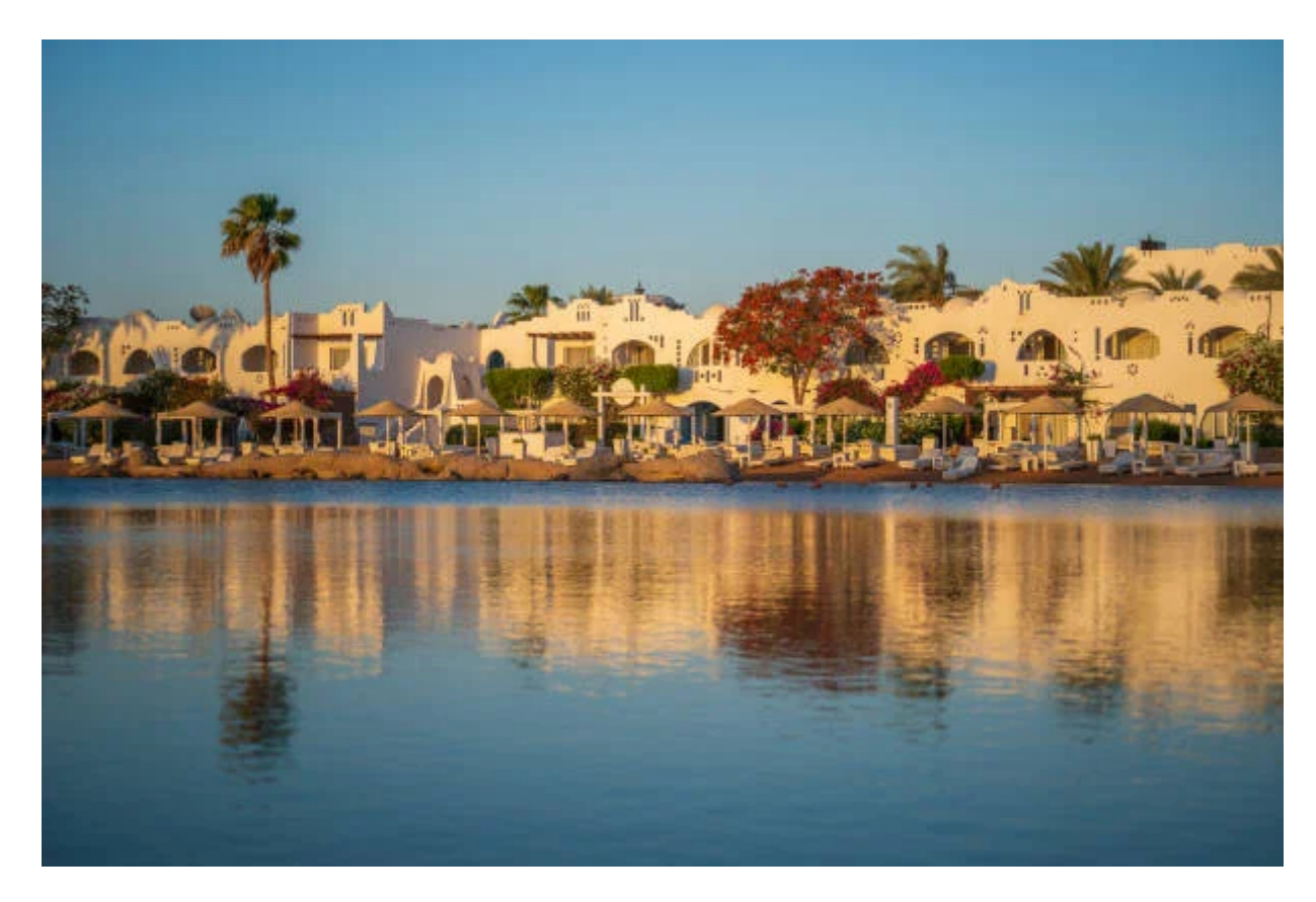
Dia 2: Fly to Sharm El-Sheikh