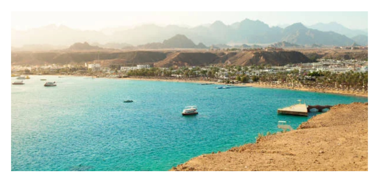
Dia 2: Fly to Sharm El-Sheikh