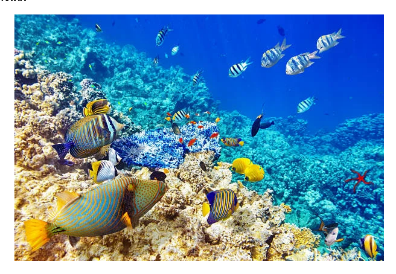
Dia 2: Shram El- Sheikh

Once you arrive at Cairo Airport, our representative will receive and welcome you, and then you will travel to Sharm El-Sheikh When you arrive at the airport, our representative will be waiting for you. He will take you in an air-conditioned car to go to your hotel to relax.