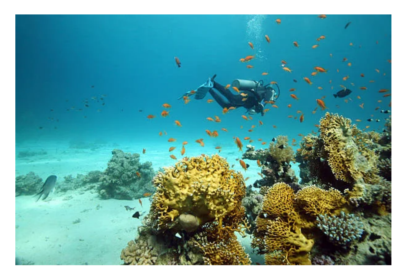
Dia 1: Arrival

Once you arrive at Cairo Airport, our representative will receive and welcome you, and then you will travel to Sharm El-Sheikh When you arrive at the airport, our representative will be waiting for you. He will take you in an air-conditioned car to go to your hotel to relax.