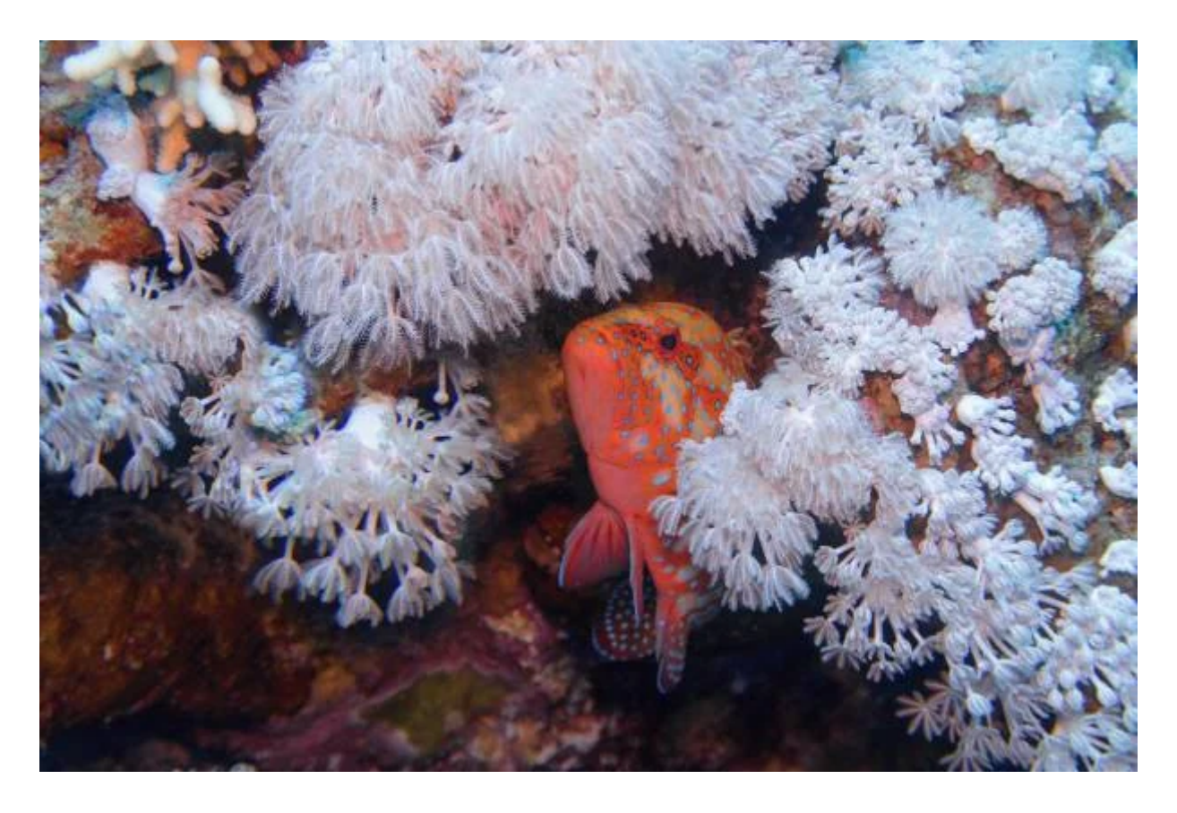
Dia 5: Sharm El-Sheikh

then on to Sharm El-Sheikh to spend some lovely relaxing time by the Sea Mediterranean.. When the skies are clear, you can enjoy many activities, including water skiing, diving, dolphin watching and more When you return to Cairo,