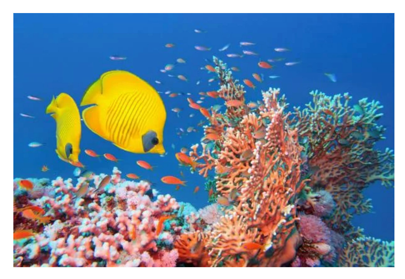
Dia 4: Fly to Sharm El-Sheikh

then on to Sharm El-Sheikh to spend some lovely relaxing time by the Sea Mediterranean.. When the skies are clear, you can enjoy many activities, including water skiing, diving, dolphin watching and more When you return to Cairo,