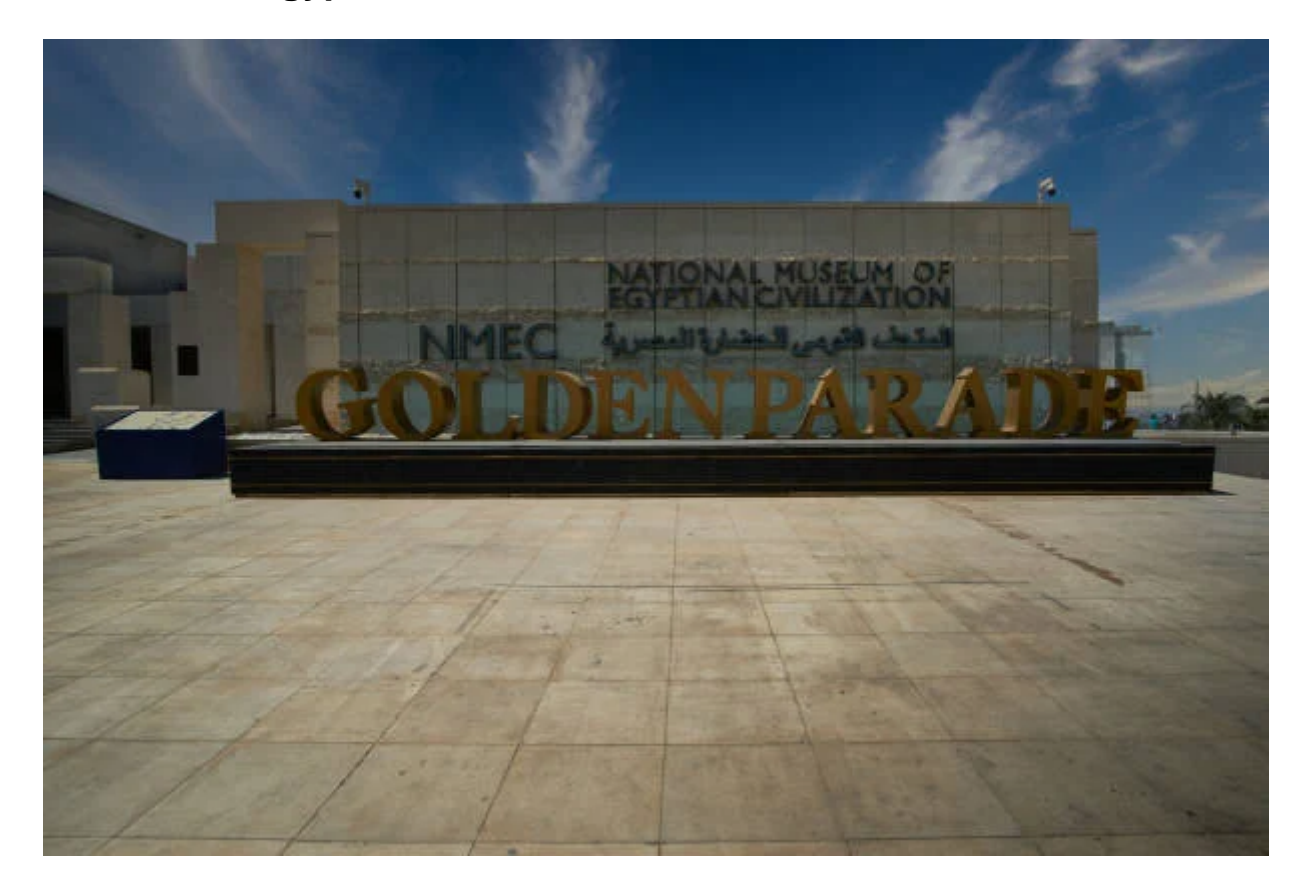
Dia 7: Fly back to Cairo, National Egyptian Civilization, Khan El Khalili