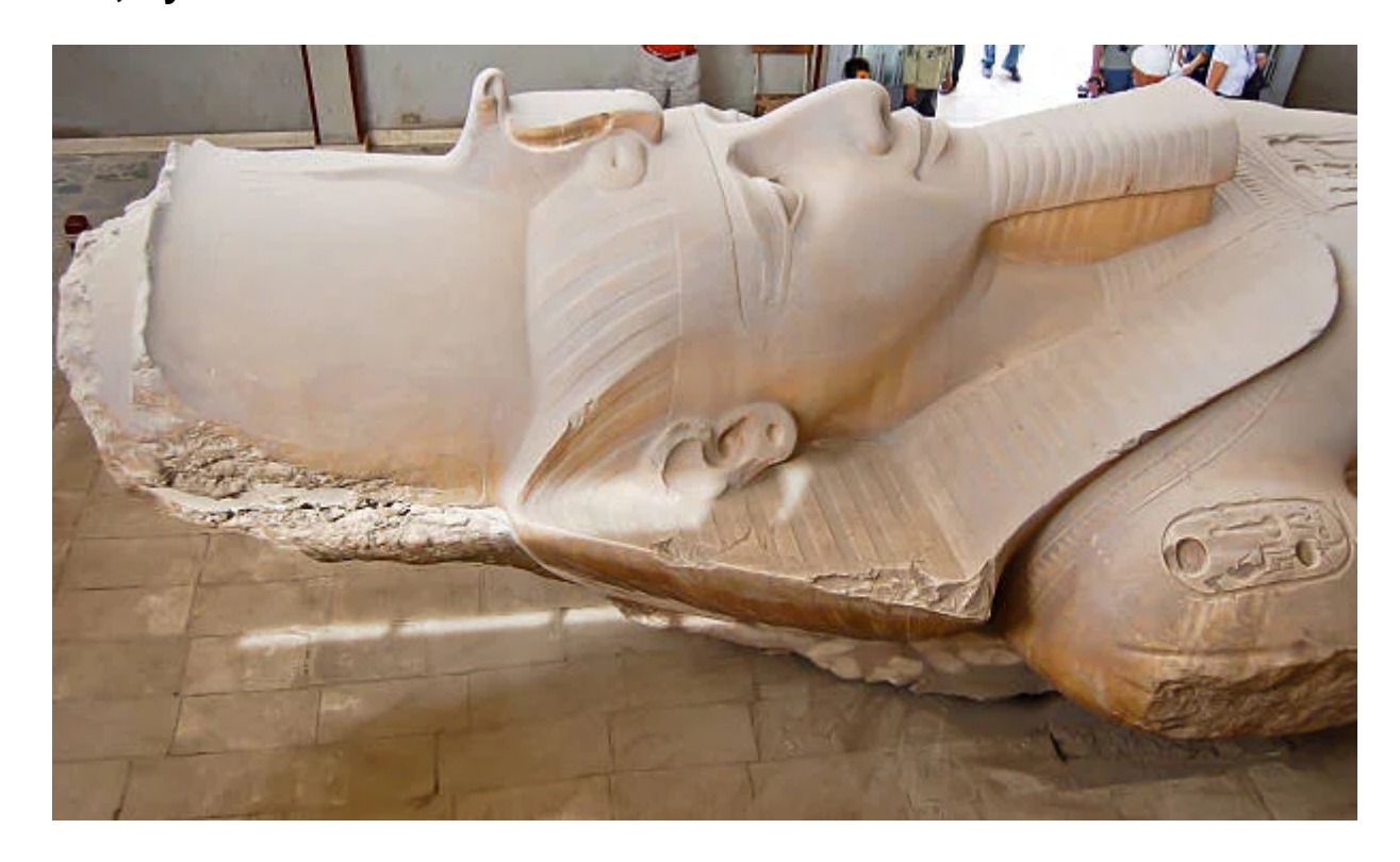
Dia 2: Memphis, Sakkara, Pyramids Tour