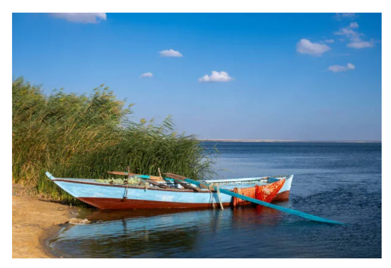
Dia 4: Overday Fayoum

The journey of a long weekend Cairo starts at the first ever capital of ancient Egypt and the most important city in the world thousands of years ago, the ancient city of Memphis , Giza Pyramids and The next stop is Saqqara , the burial ground for Egyptian kings and royals, will go to the National Museum of Civilization , the Museum of Egypt , and the Museum of Coptic Civilization. There, you can find out more about the Jewish Temple and the suspended church. Our agent will transport you to AI-Fayoum the following morning after hotel breakfast, where he will offer you an interesting tour and drop you off at the Tunis village for breakfast. To purchase gifts, you will next travel to Salahuddin and then to Khan Khalil Bazar . A member of our group will drive you to the airport early the next morning.