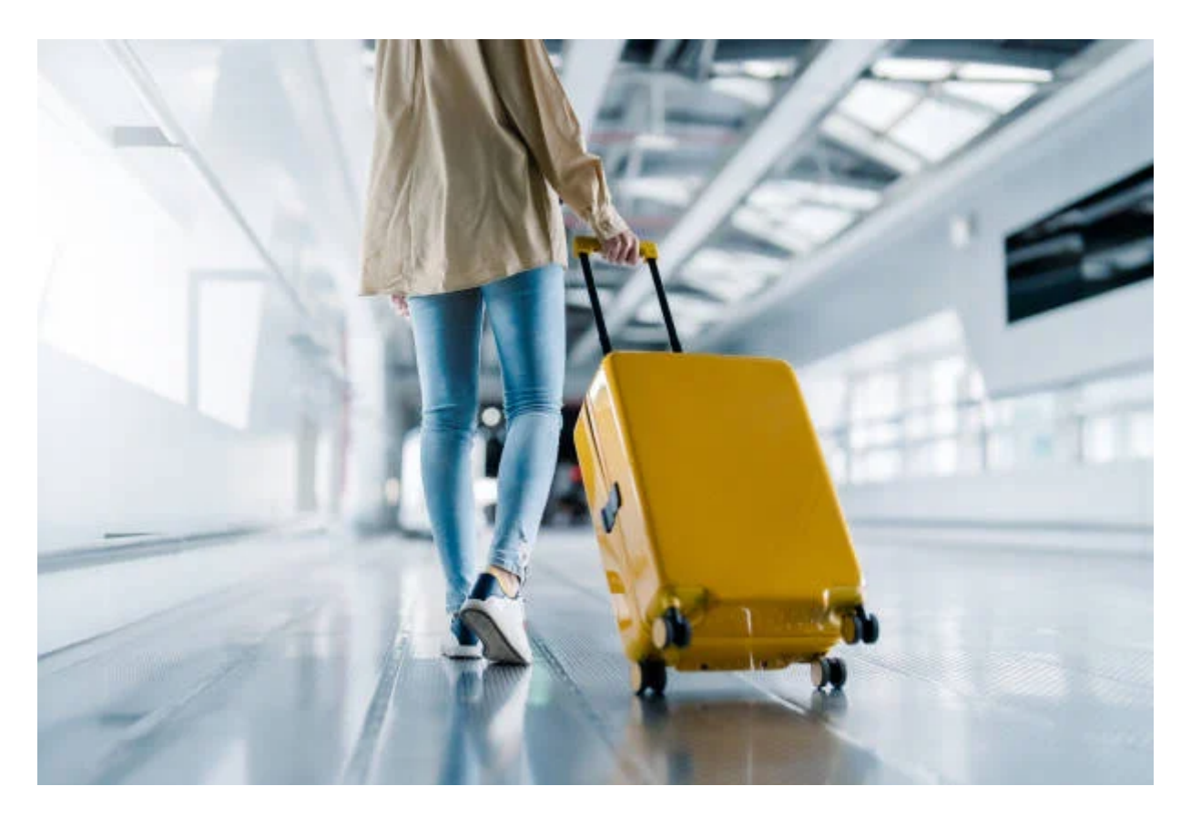
Dia 1: Arrival