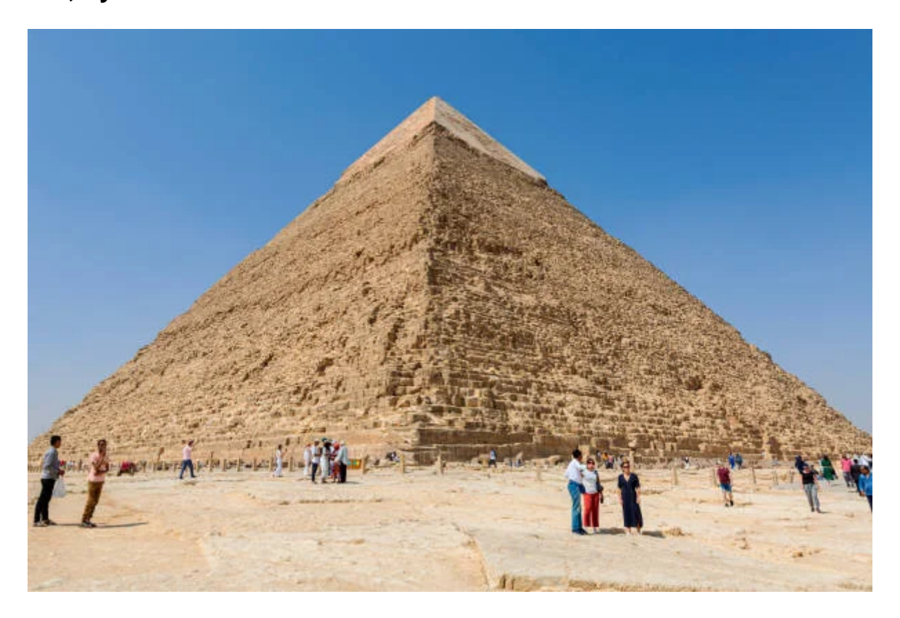
Dia 2: Memphis, Sakkara, Pyramids Tour