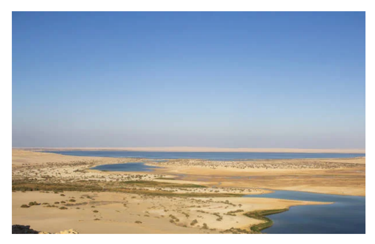
Dia 5: Overday Fayoum