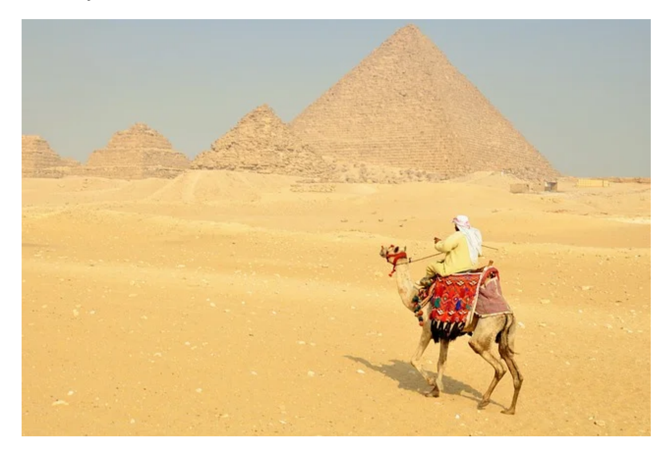
Dia 2: Memphis, Sakkara, Pyramids Tour