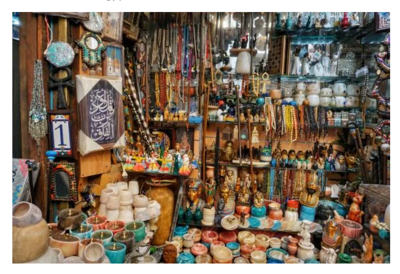
Giorno 7: Fly back to Cairo, National Egyptian Civilization, Khan El Khalili