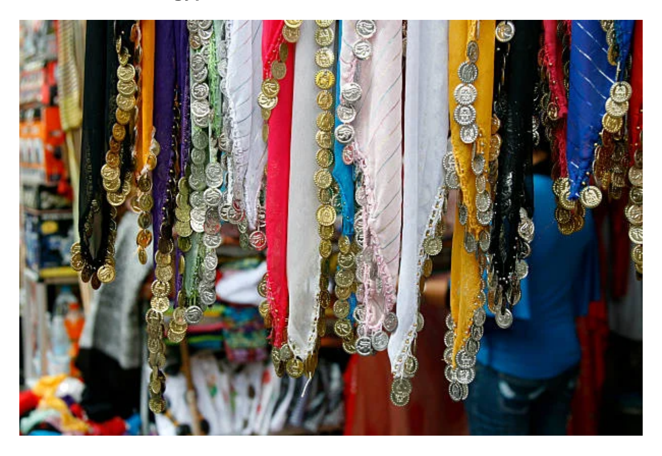
Giorno 7: Fly back to Cairo, National Egyptian Civilization, Khan El Khalili