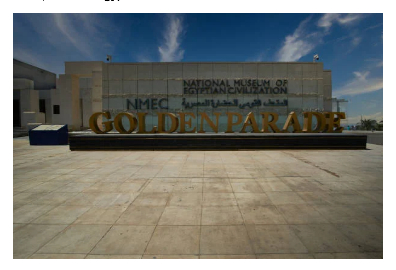
Giorno 9: Fly back to Cairo, National Egyptian Civilization