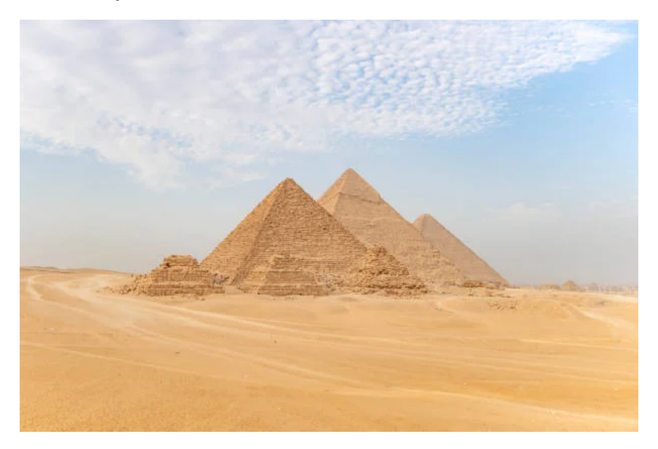
Giorno 2: Memphis , Sakkara , Pyramids Tour