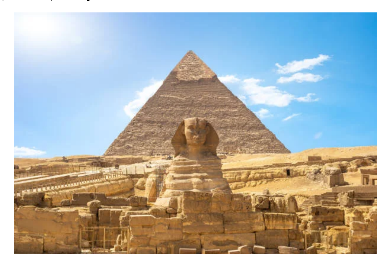
Giorno 2: Memphis, Sakkara, and Pyramids Tour