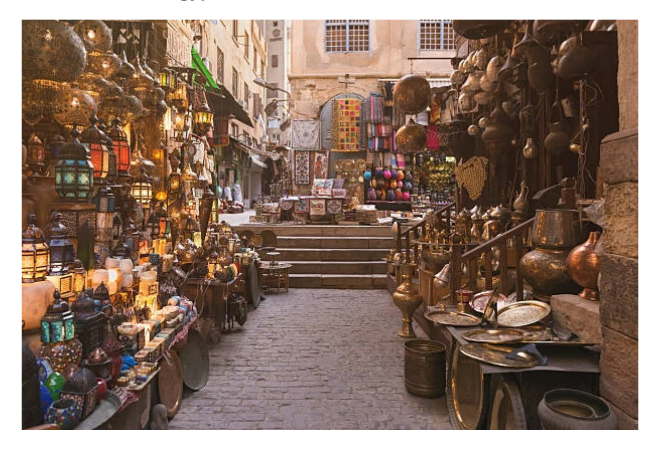
Giorno 6: Fly back to Cairo, National Egyptian Civilization, Khan El Khalili

Our representative will receive you from the airport carrying a banner bearing your name. After welcoming you at the airport, he will take you to a hotel in Cairo. The next day, you will go to Marsa Alam and enjoy the beaches of Marsa Alam . You can do many activities. The next day, you will go on a safari tour with our representative, and after spending two days in... Marsa Alam You will continue the rest of your trip in Cairo. Your trip will begin by visiting the Egyptian Museum and, in the evening,