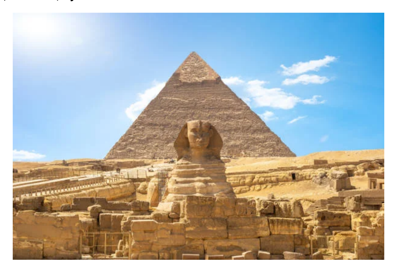
Giorno 7: Memphis, Sakkara, Pyramids Tour

Our representative will receive you from the airport carrying a banner bearing your name. After welcoming you at the airport, he will take you to a hotel in Cairo. The next day, you will go to Marsa Alam and enjoy the beaches of Marsa Alam . You can do many activities. The next day, you will go on a safari tour with our representative, and after spending two days in... Marsa Alam You will continue the rest of your trip in Cairo. Your trip will begin by visiting the Egyptian Museum and, in the evening,