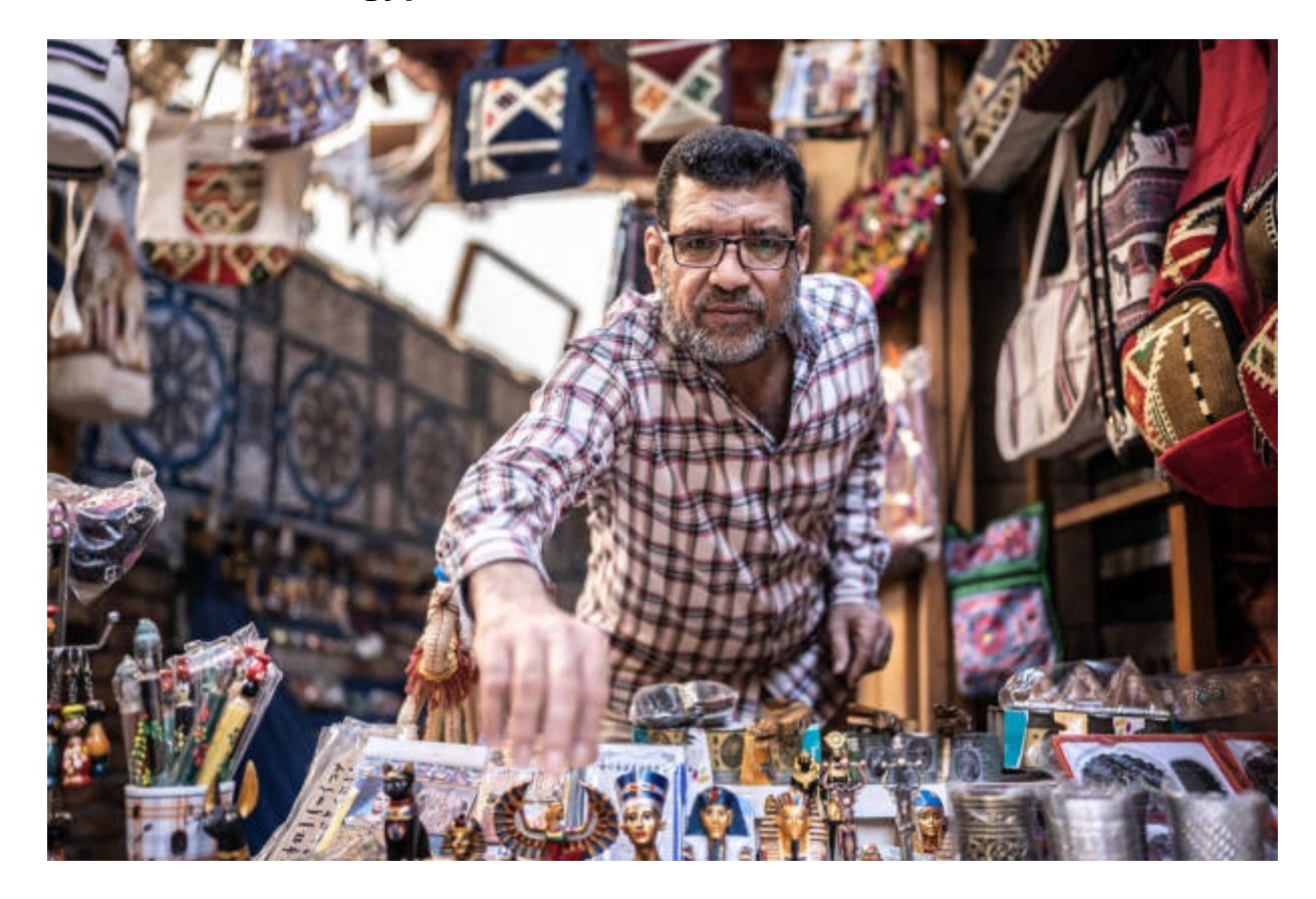
Giorno 6: Fly back to Cairo, National Egyptian Civilization, Khan El Khalili

Our representative will receive you from the airport carrying a banner bearing your name. After welcoming you at the airport, he will take you to a hotel in Cairo. The next day, you will go to Sharm El-Sheikh and enjoy the beaches of Sharm El-Sheikh . You can do many activities. The next day, you will go on a safari tour with our representative, and after spending two days in. Sharm El-Sheikh You will continue the rest of your trip in Cairo. Your trip will begin by visiting the Egyptian Museum a nd, in the evening,