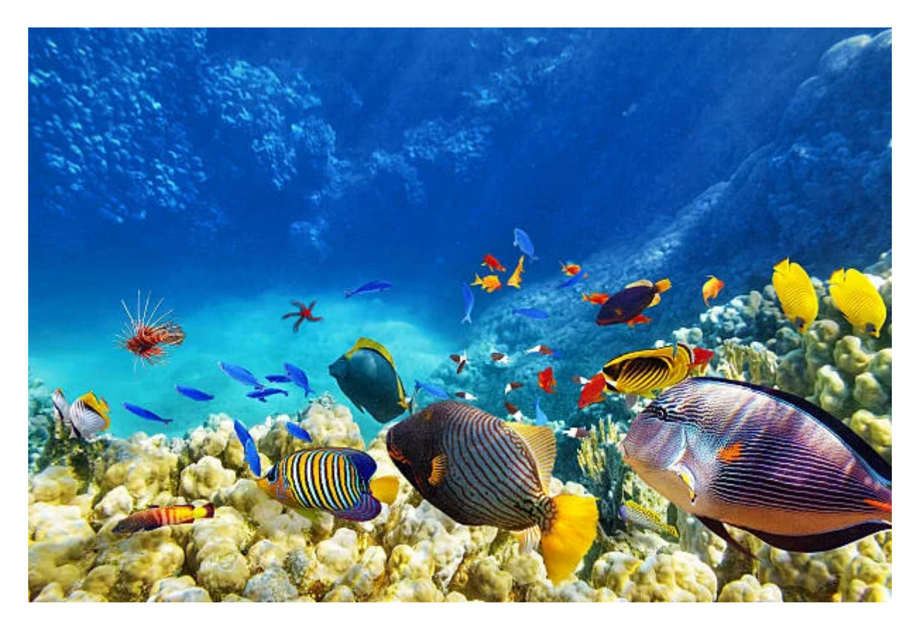
Giorno 2: Fly to Sharm El Sheikh

Our representative will receive you from the airport carrying a banner bearing your name. After welcoming you at the airport, he will take you to a hotel in Cairo. The next day, you will go to Sharm El-Sheikh and enjoy the beaches of Sharm El-Sheikh . You can do many activities. The next day, you will go on a safari tour with our representative, and after spending two days in. Sharm El-Sheikh You will continue the rest of your trip in Cairo. Your trip will begin by visiting the Egyptian Museum a nd, in the evening,